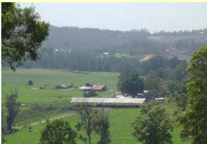
Arrowroot Building & Dairy

Dairying and small crops became the main activities on Otmoor and in 1935, Otmoor farm was purchased by Fred and Edwin Kleinschmidt. Under the Kleinschmidt brothers, arrowroot became the principal crop on Otmoor. They constructed a mill and by the 1950s, Otmoor farm was one of the major producers of arrowroot in the region. By the 1970s, Otmoor was finding competition from overseas imports increasingly difficult to sustain a viable operation and finally production ceased in 1976. With the closure of the mill, dairying became the principal activity once again on the farm until it was sold in 2004 to be developed for residential and recreational use.