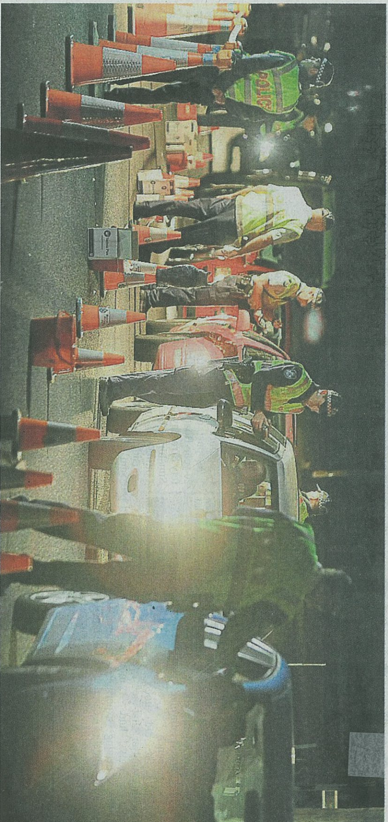
ON THE JOB: Police conducted a major RBT on the Bruce Hwy at the Ettamogah Pub on Wednesday.