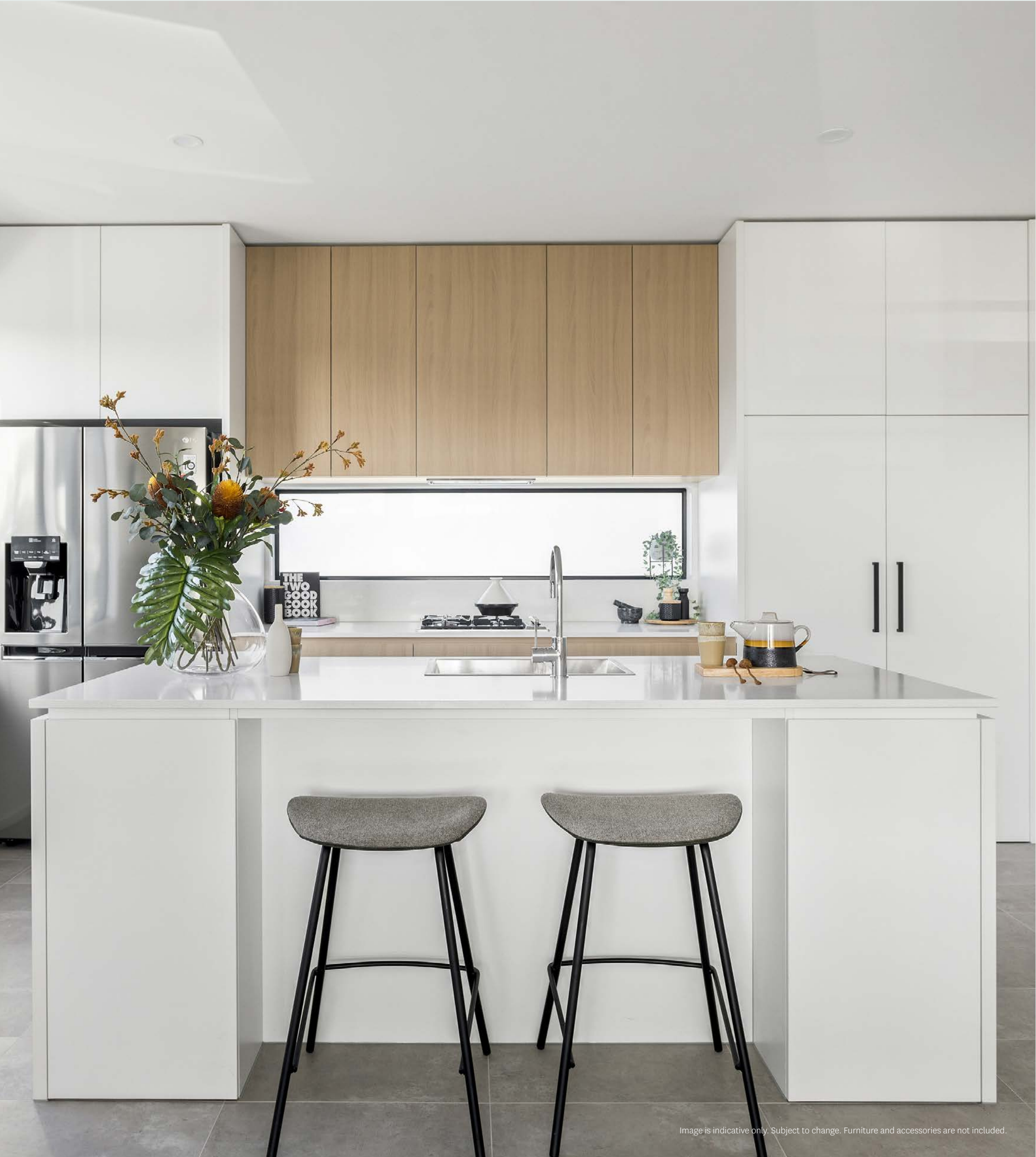
Image is indicative only. Subject to change. Furniture and accessories are not included.