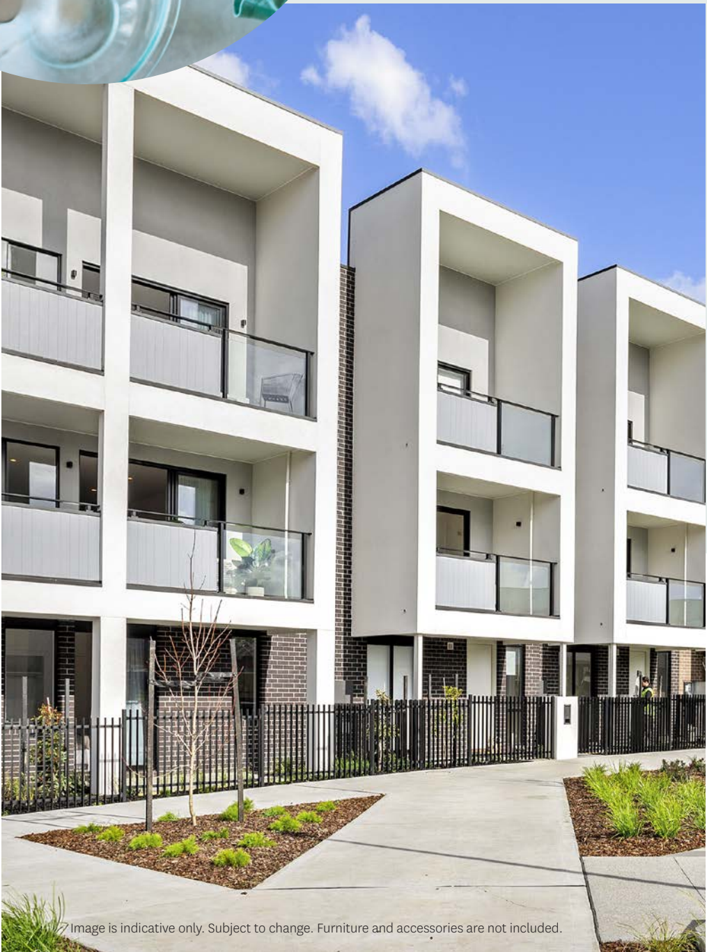
Image is indicative only. Subject to change. Furniture and accessories are not included.