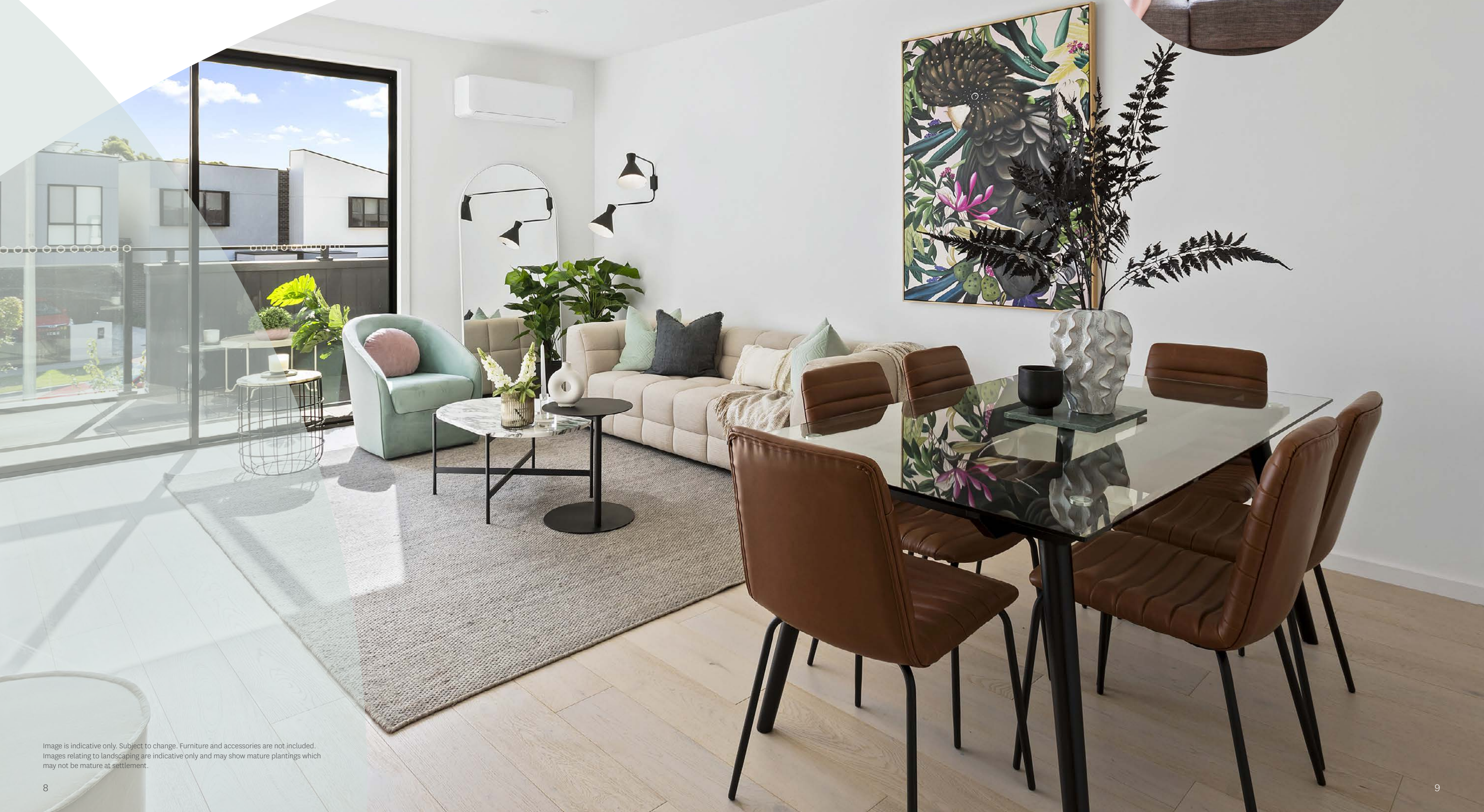
Image is indicative only. Subject to change. Furniture and accessories are not included. Images relating to landscaping are indicative only and may show mature plantings which may not be mature at settlement.