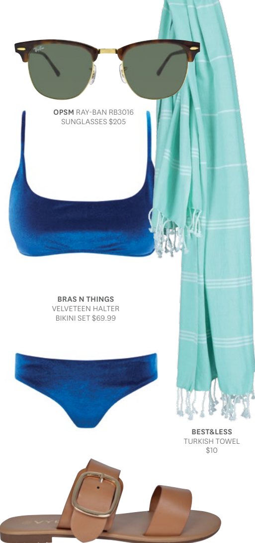
SPEND-LESS SHOES NATASHA SANDAL $29.99

If you're after the most luxurious Whitsundays experience, you can't go past Qualia Resort on Hamilton Island. If you don't want the hassle of organising it all yourself, Helloworld Travel will get you sorted so you can spend all your time relaxing on the stunning beaches. Try your hand at sailing (champagne recommended) and check out Heart Reef for an experience you won't forget. Taking a scenic flight over the reef is the perfect way to finish your heavenly beach escape.