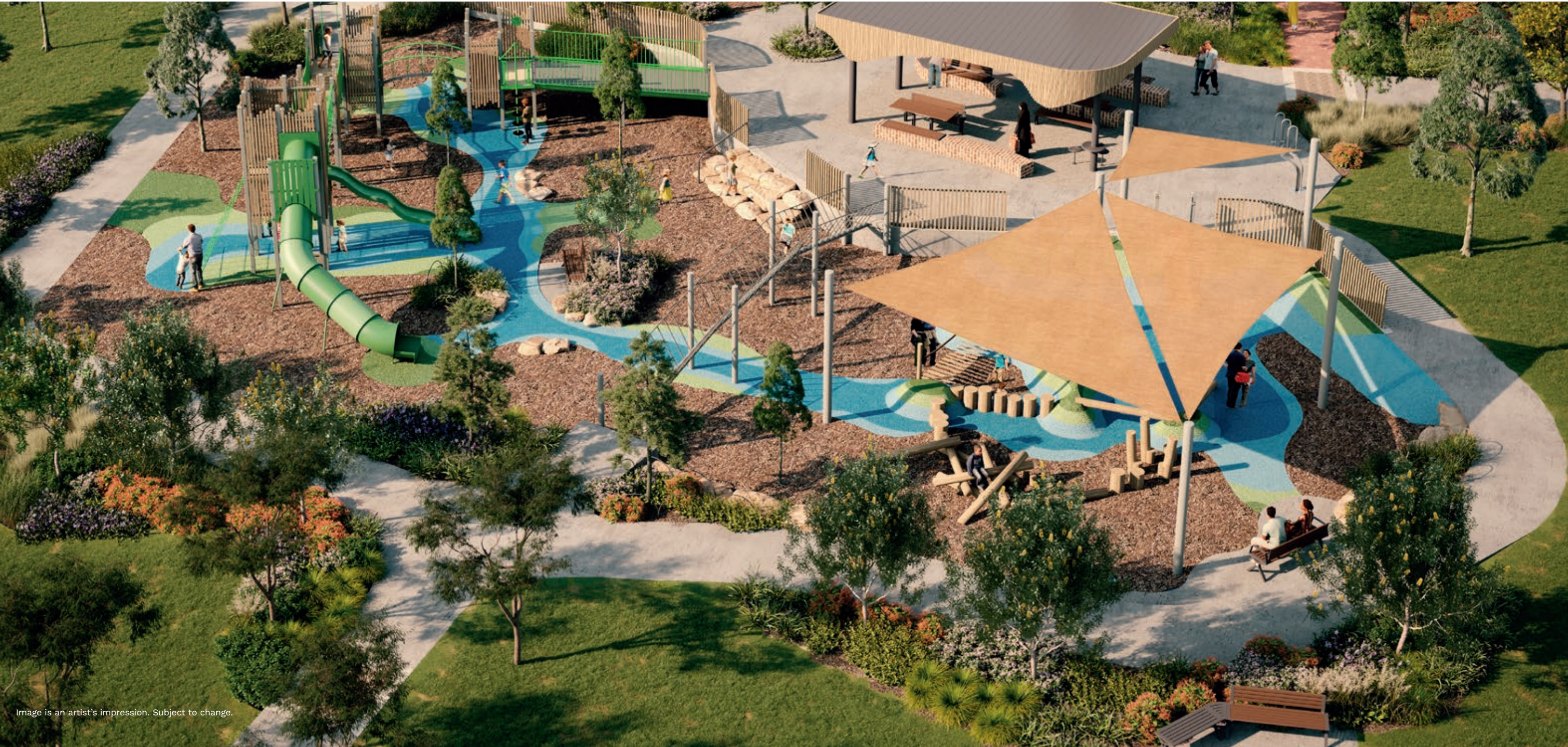
Image is an artist's impression. Subject to change.