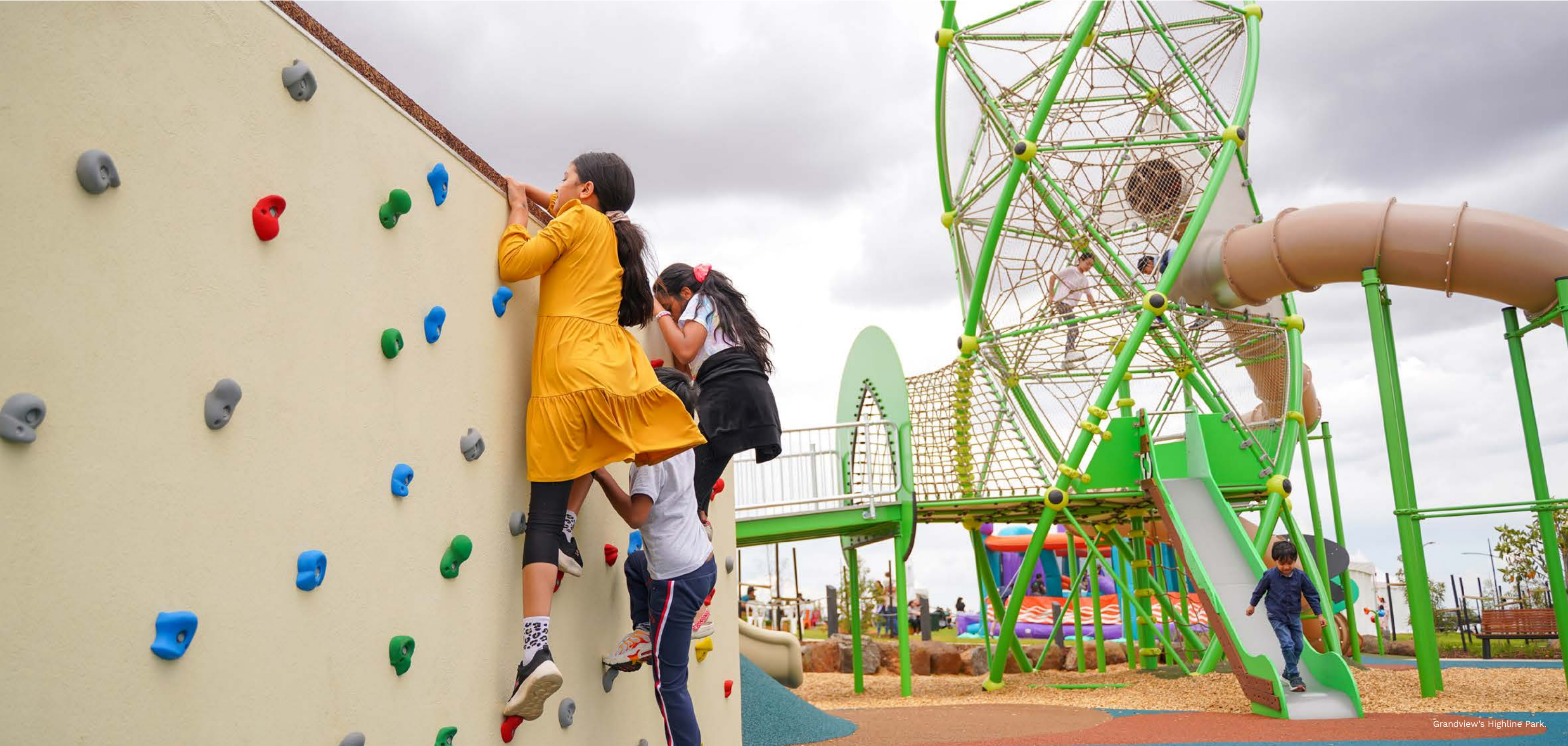
Grandview's Highline Park.