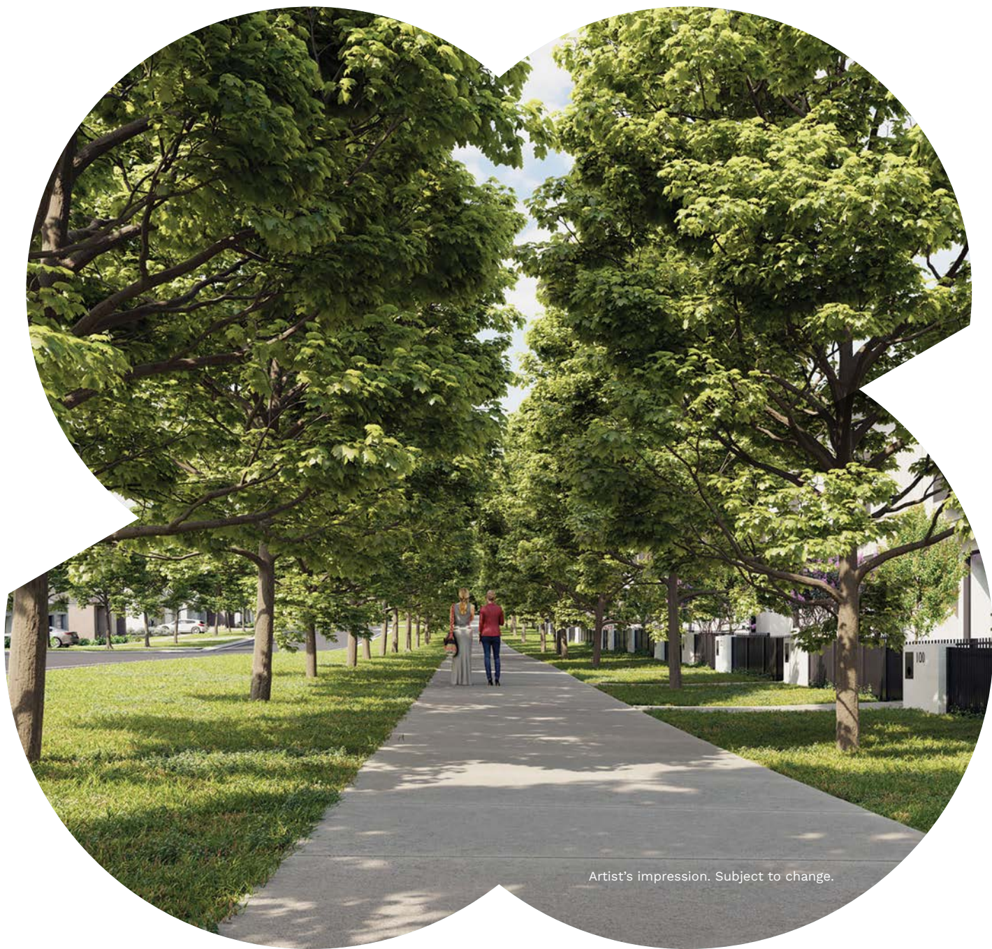
Artist's impression. Subject to change.