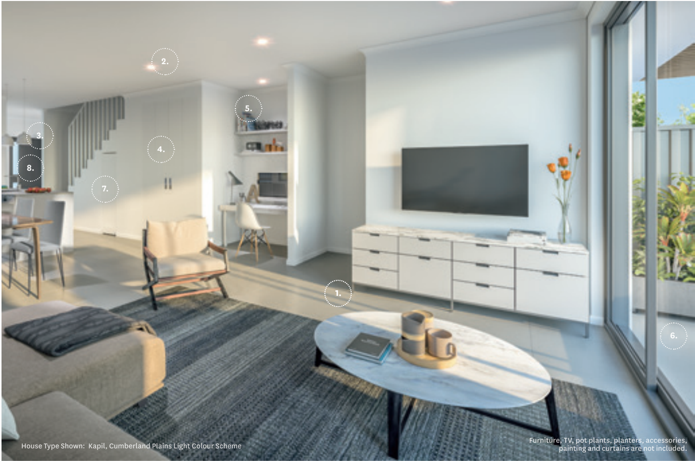
House Type Shown: Kapil, Cumberland Plains Light Colour Scheme