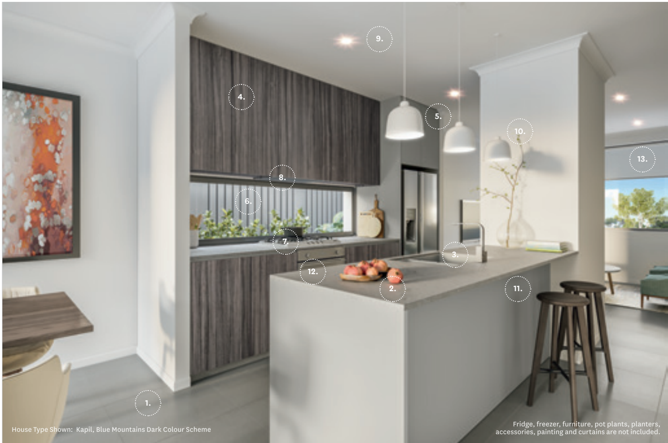
House Type Shown: Kapil, Blue Mountains Dark Colour Scheme