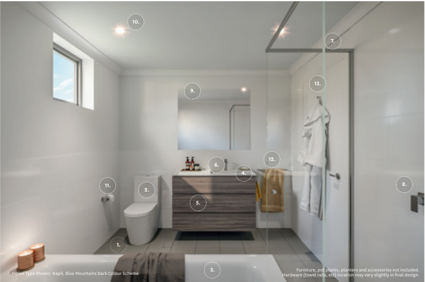
House Type Shown: Kapil, Blue Mountains Dark Colour Scheme