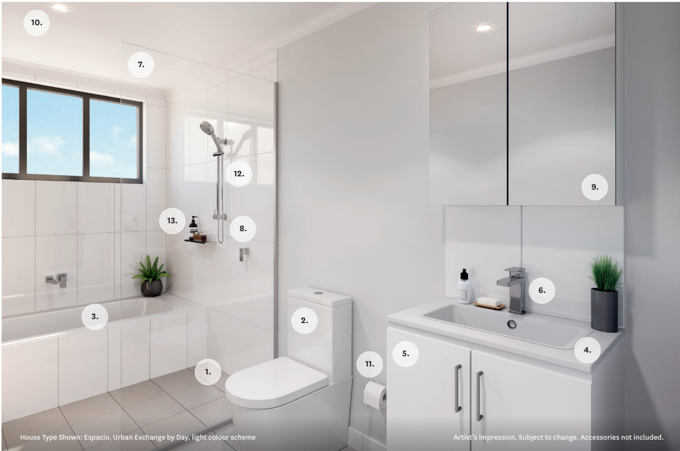
House Type Shown: Espacio, Urban Exchange by Day, light colour scheme