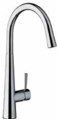
04 Alder Nuova Calare pull out Kitchen sink mixer (85326)