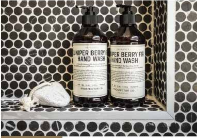
09 600mm high x 600mm wide tiled shower niches