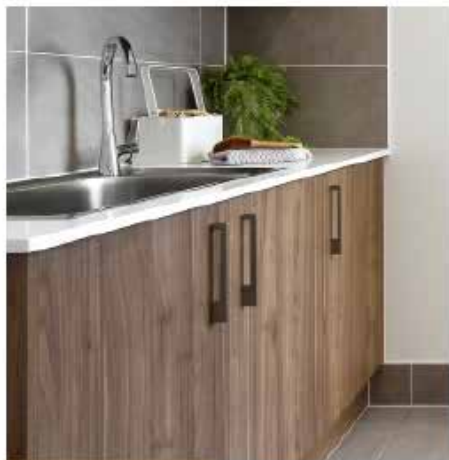
15 20mm Silestone benchtop with Polytec Woodmatt Laminate underbench cupboards up to 1200mm wide to Laundry