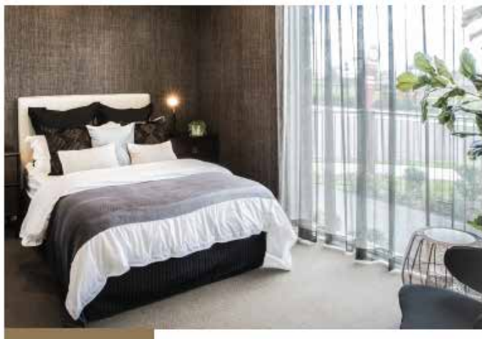
Carpet to Bedrooms, Hallways, Stairs and separate Living room*