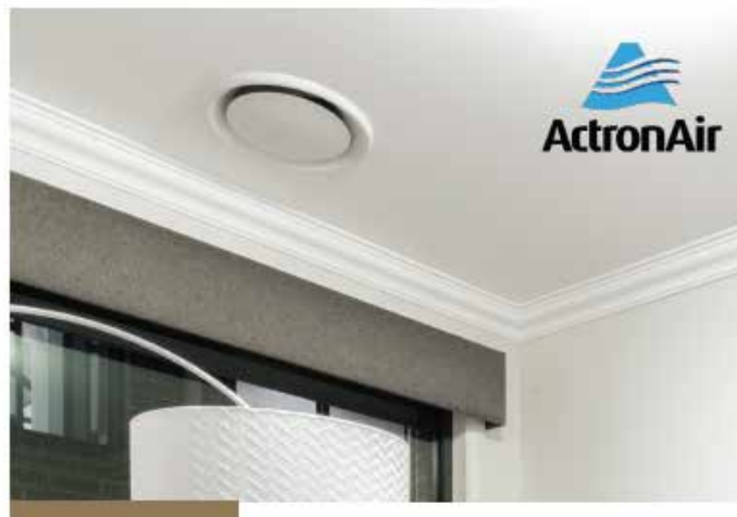
Actron reverse cycle ducted air conditioning*

Floor Coverings + Ducted Air-Conditioning FREE