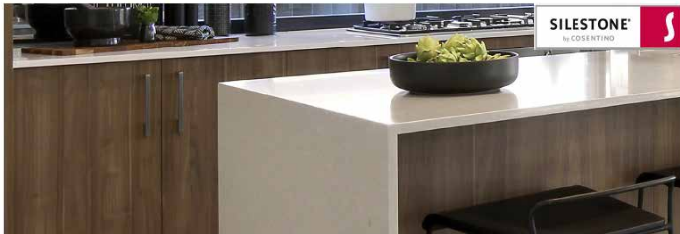
01 Silestone waterfall ends to Kitchen island benchtop with sandwich edge