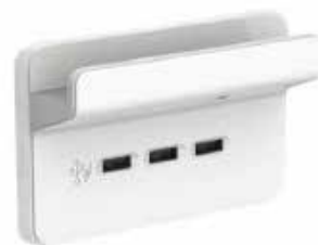
14 Clipsal Iconic USB charging station (3043HSUSB)