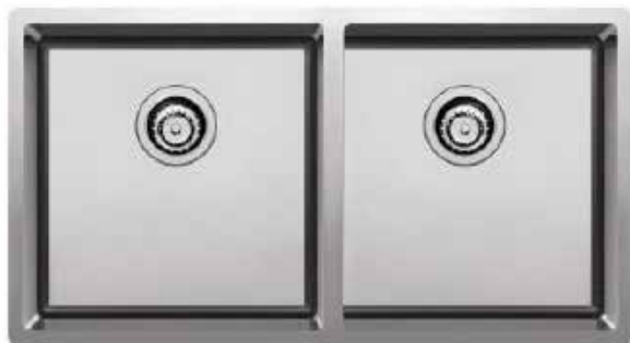
05 Clark Prism undermount Kitchen sink (PPR20B)