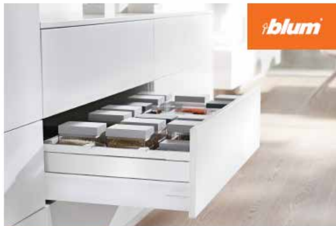
02 Soft close drawers and cupboards to Kitchen