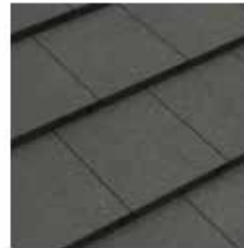
20 Bristle Prestige range concrete roof tiles