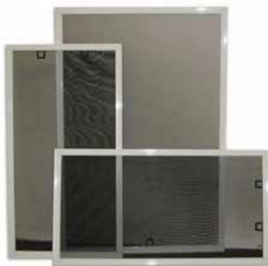
23 Flyscreens with nylon mesh to all openable windows