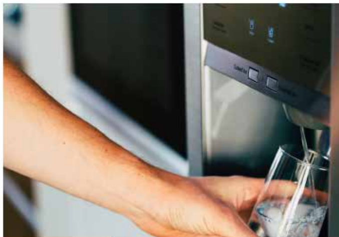
07 Cold water point to rear of fridge