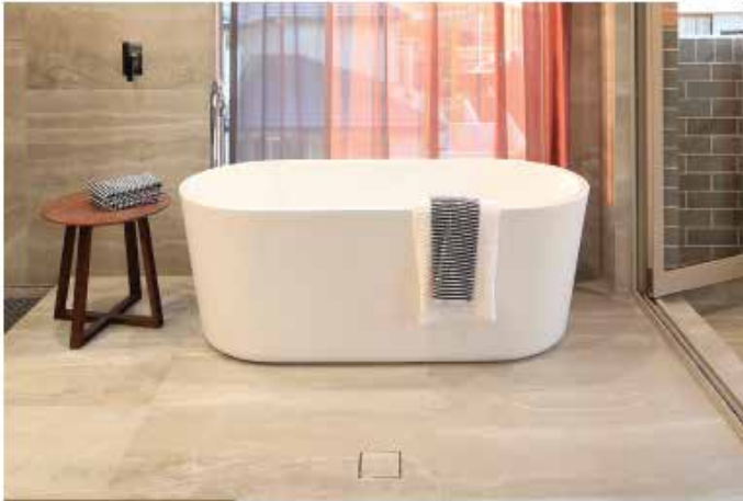
10 Smartile floor wastes to all wet areas