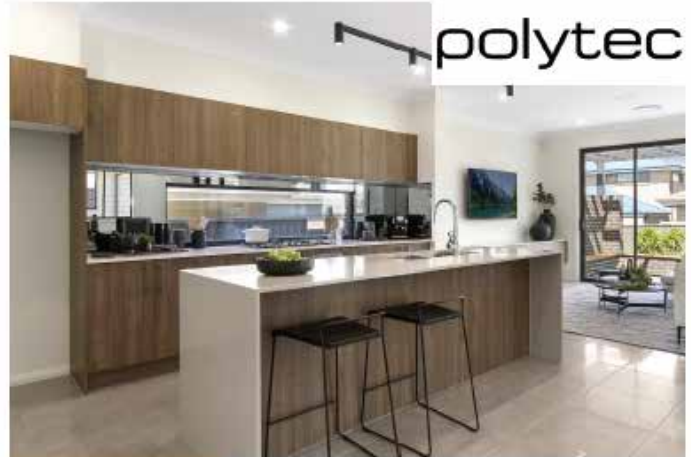
12 Polytec Woodmatt textured laminate finish to Kitchen