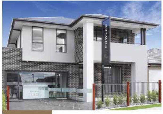
19 Smooth cement render and paint finish to façade included areas in lieu of standard texture coat bagging finish