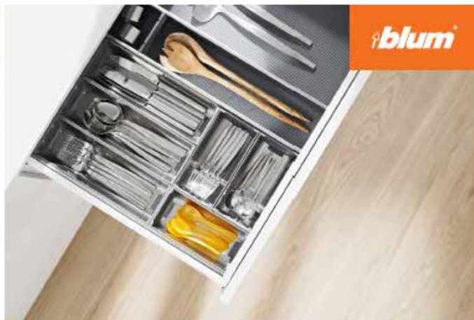
03 Stainless steel cutlery tray