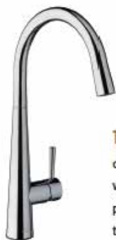
16 Clark Square 45L drop-in sink (CL20002.1) with Alder Nuova Calare pull out sink mixer (85326) to Laundry