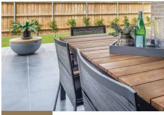
Ceramic floor tiling to Patio and Outdoor Retreat*

PLUS 25 extra items FREE! Valued at $25,500!