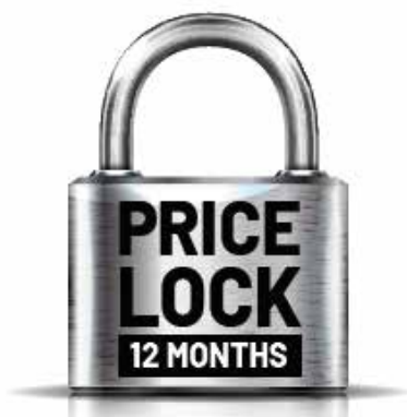
25 365 calendar day tender