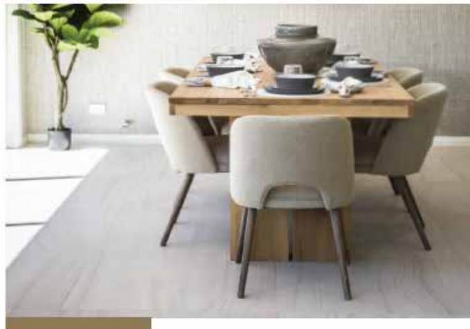
600 x 800 polished porcelain floor tiling or laminate flooring to ground floor main living areas*