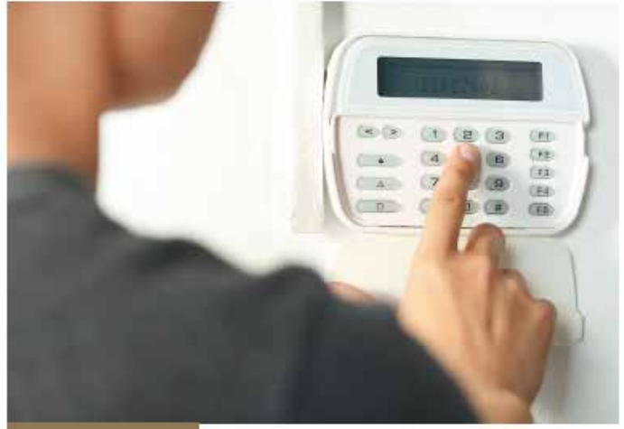
11 Alarm System DSC 3 Zone