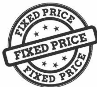
24 Fixed Price Piering (additional concrete piering at no charge)