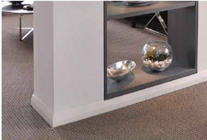
18 Corinthian SPLA7 92mm x 18mm half splayed pine painted skirting