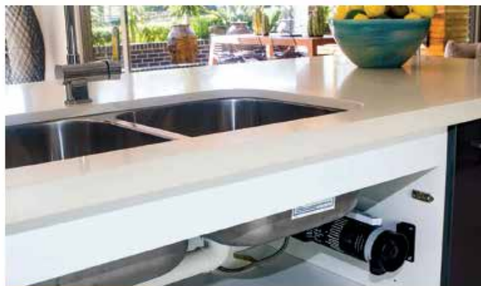
06 Water Filters Australia Platinum Inline water filter system (K-B-PLATINUMWFA5600) to Kitchen sink mixer