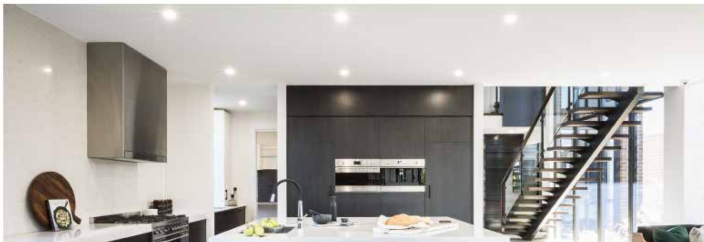
13 20 x fixed LED downlights