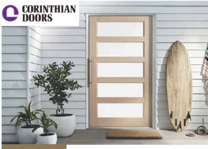
17 Corinthian American White Oak AW05G up to 1200mm wide stained front entry door