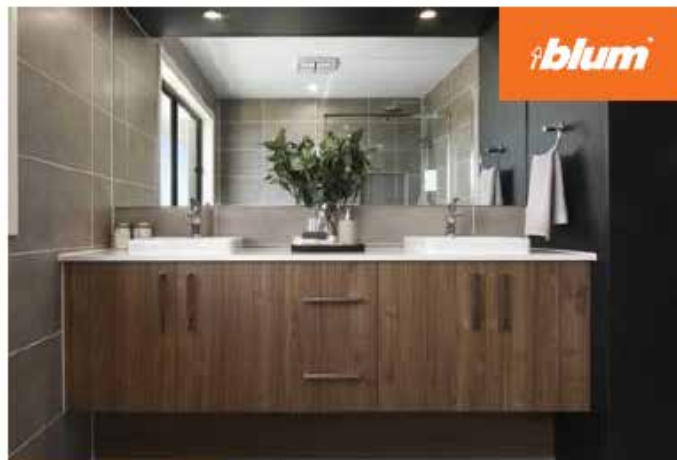
08 Soft close cupboards and drawers to vanities