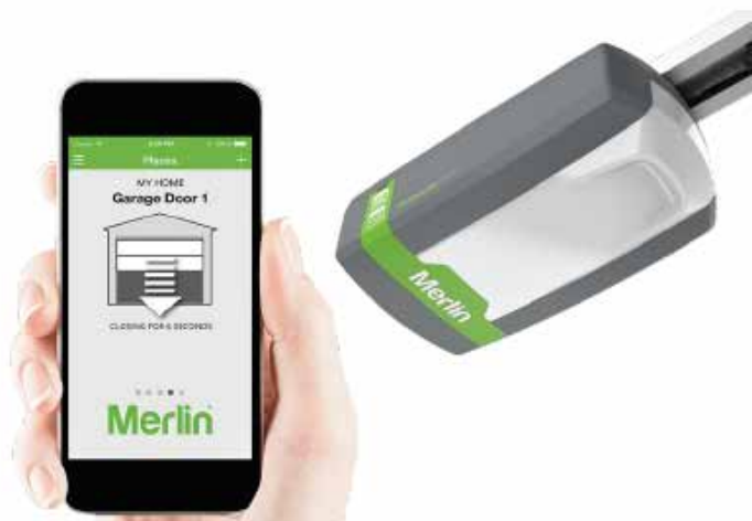
22 Merlin MS105 MYQ belt drive Garage door operator and connectivity bundle