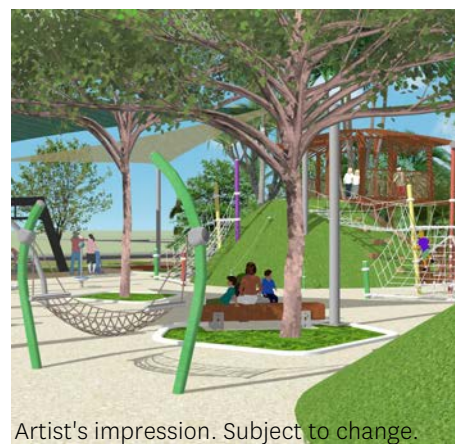
Artist's impression. Subject to change.

All plans, diagrams, photographs, illustrations, statements and information in this brochure, including without limitation the location and size of any lots, are for illustrative purposes only and are based on information available to and the intention of Stockland at the time of creation (September 2017) and are subject to change without notice. No diagram, photograph, illustration, statement or information amounts to a legally binding obligation on or warranty by Stockland and Stockland accepts no liability for any loss or damage suffered by any person who relies on them either wholly or in part.