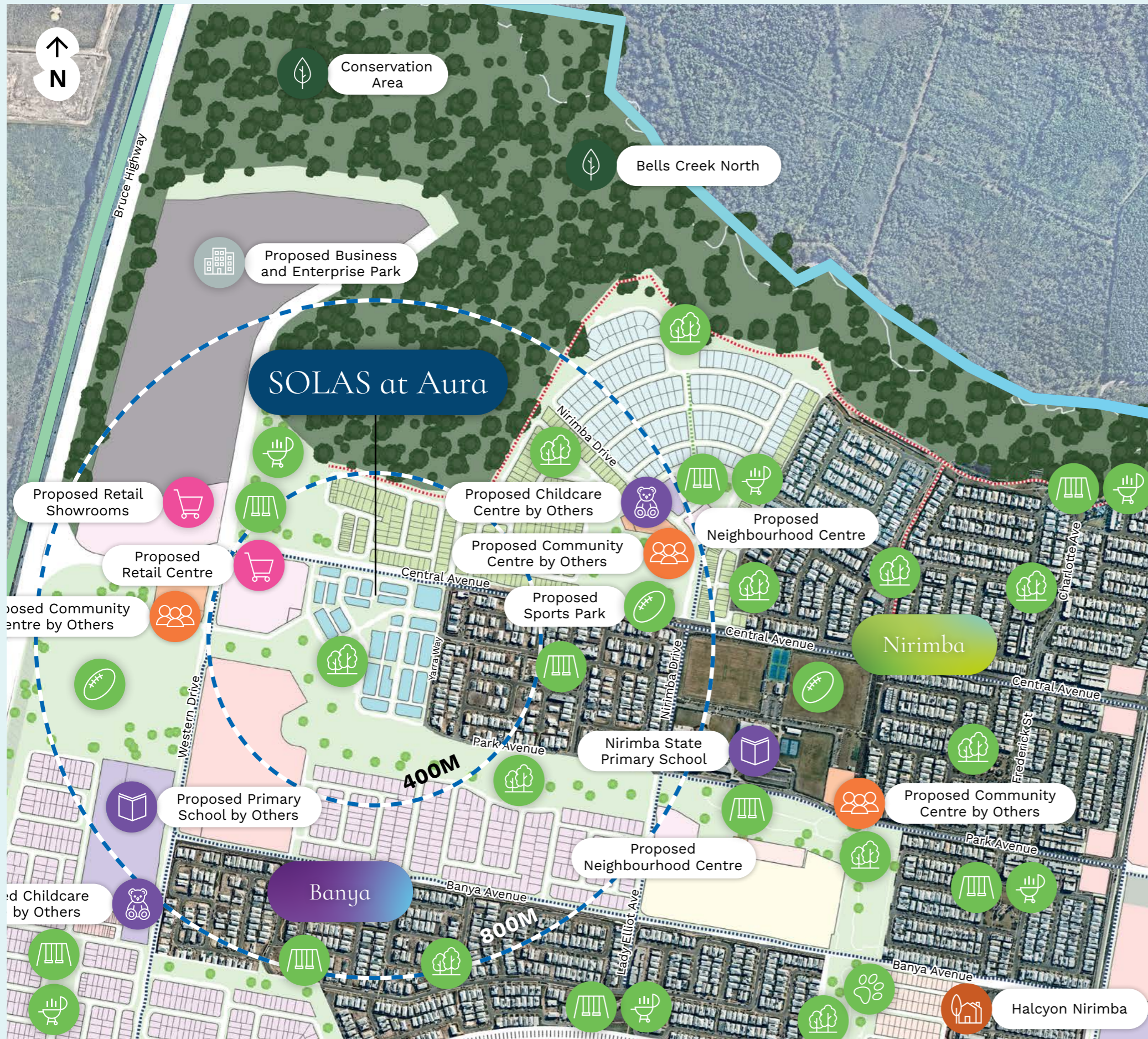
Artist's impression. Subject to change.