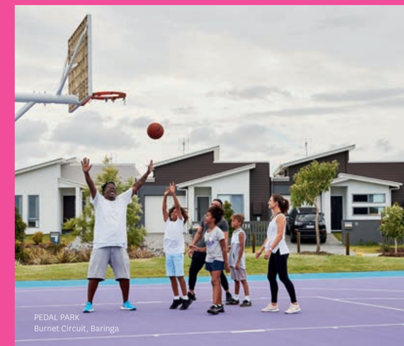
PEDAL PARK Burnet Circuit, Baringa