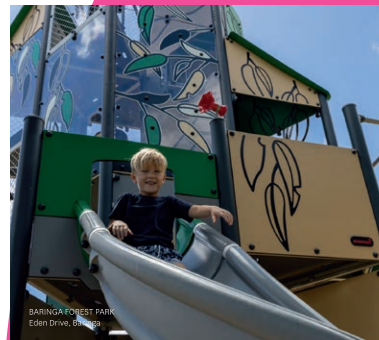
BARINGA FOREST PARK Eden Drive, Baringa