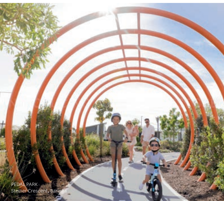
PEDAL PARK Steiner Crescent, Baringa