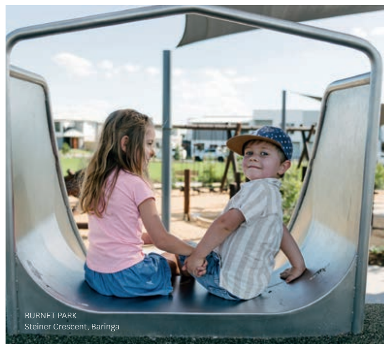
BURNET PARK Steiner Crescent, Baringa