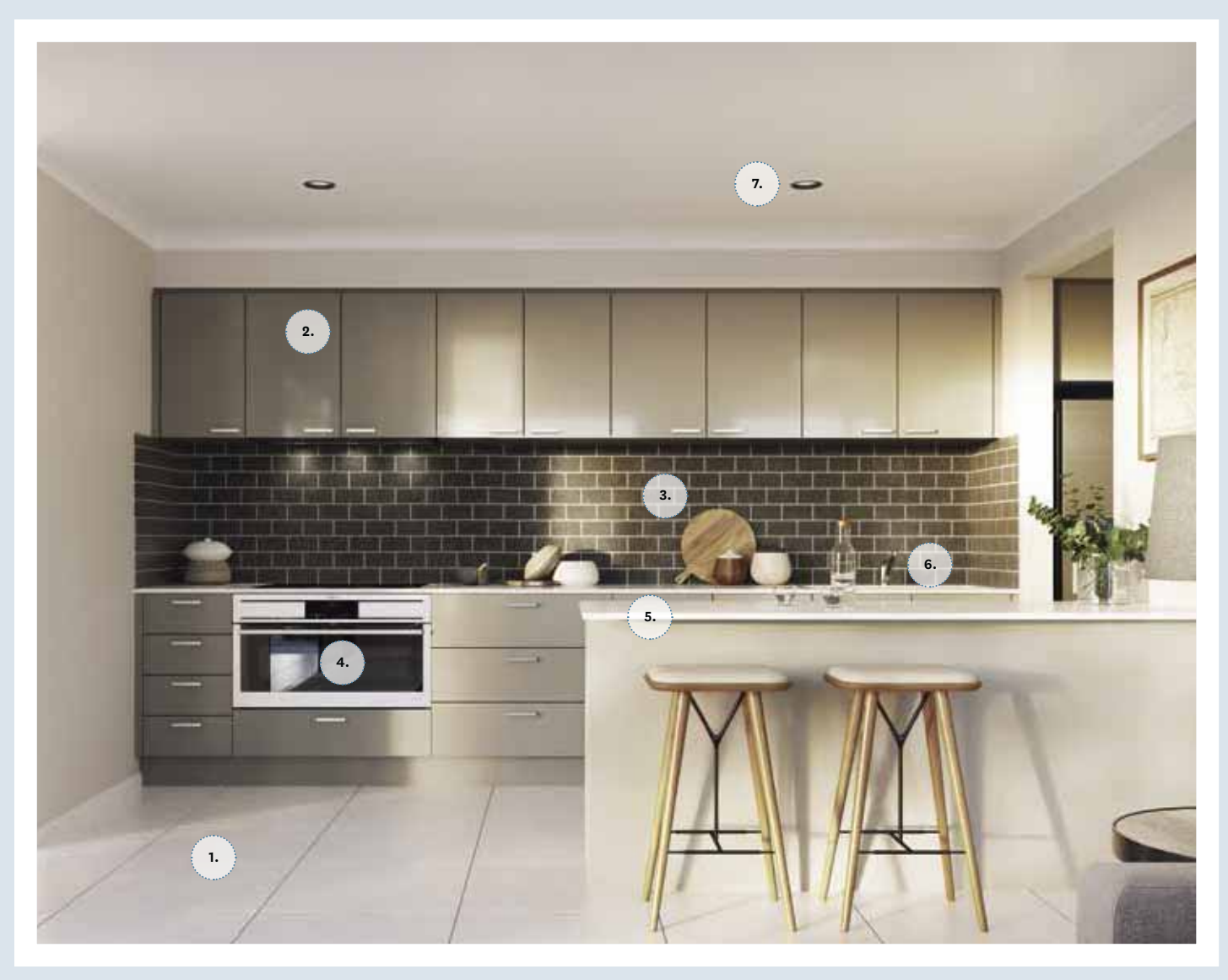
Artist's\ impression\ of\ Lot\ 92\ kitchen.\ Other\ designs\ may\ vary.\ Subject\ to\ change.\ Furniture\ not\ included.