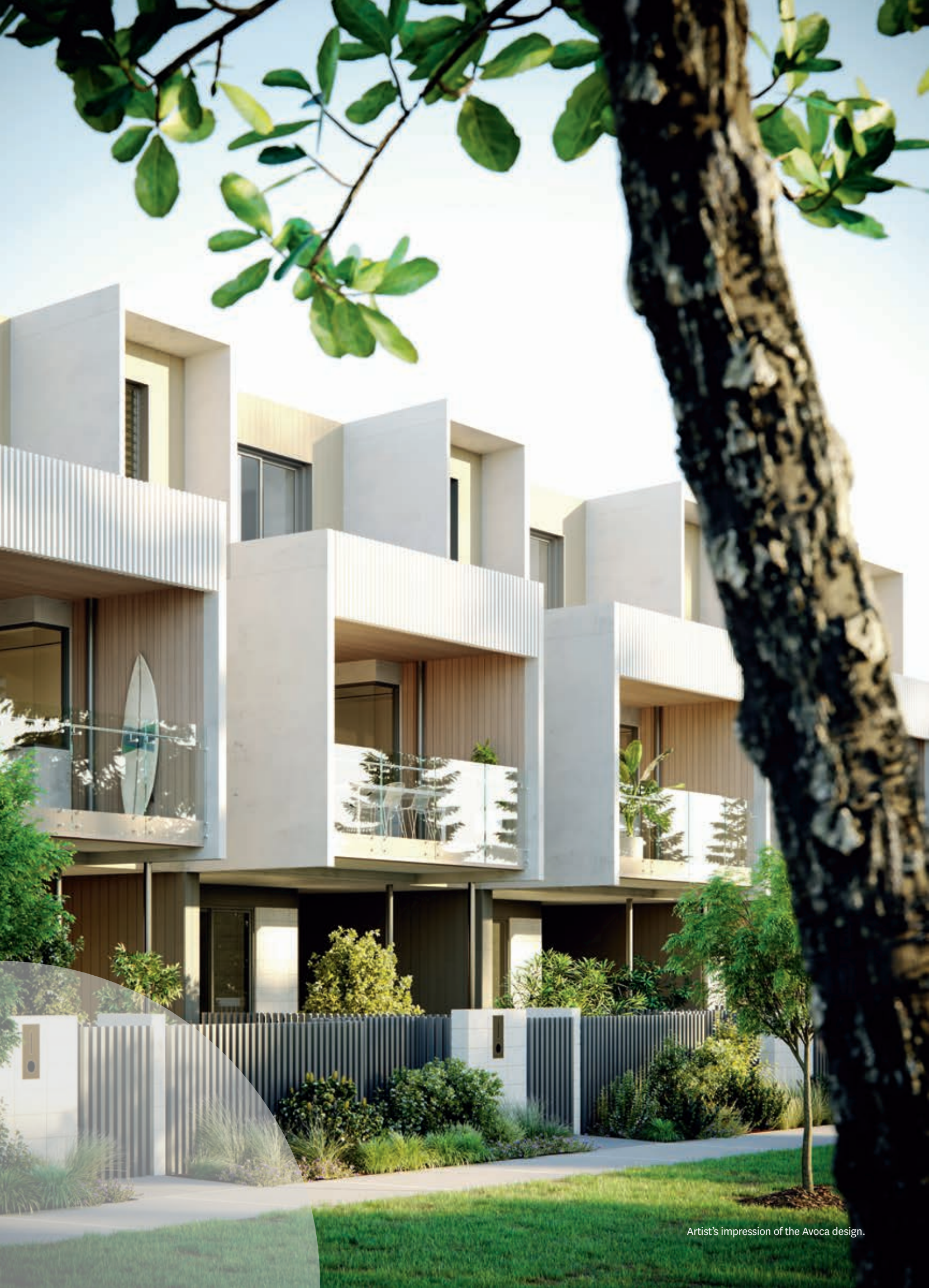
Artist's impression of the Avoca design.