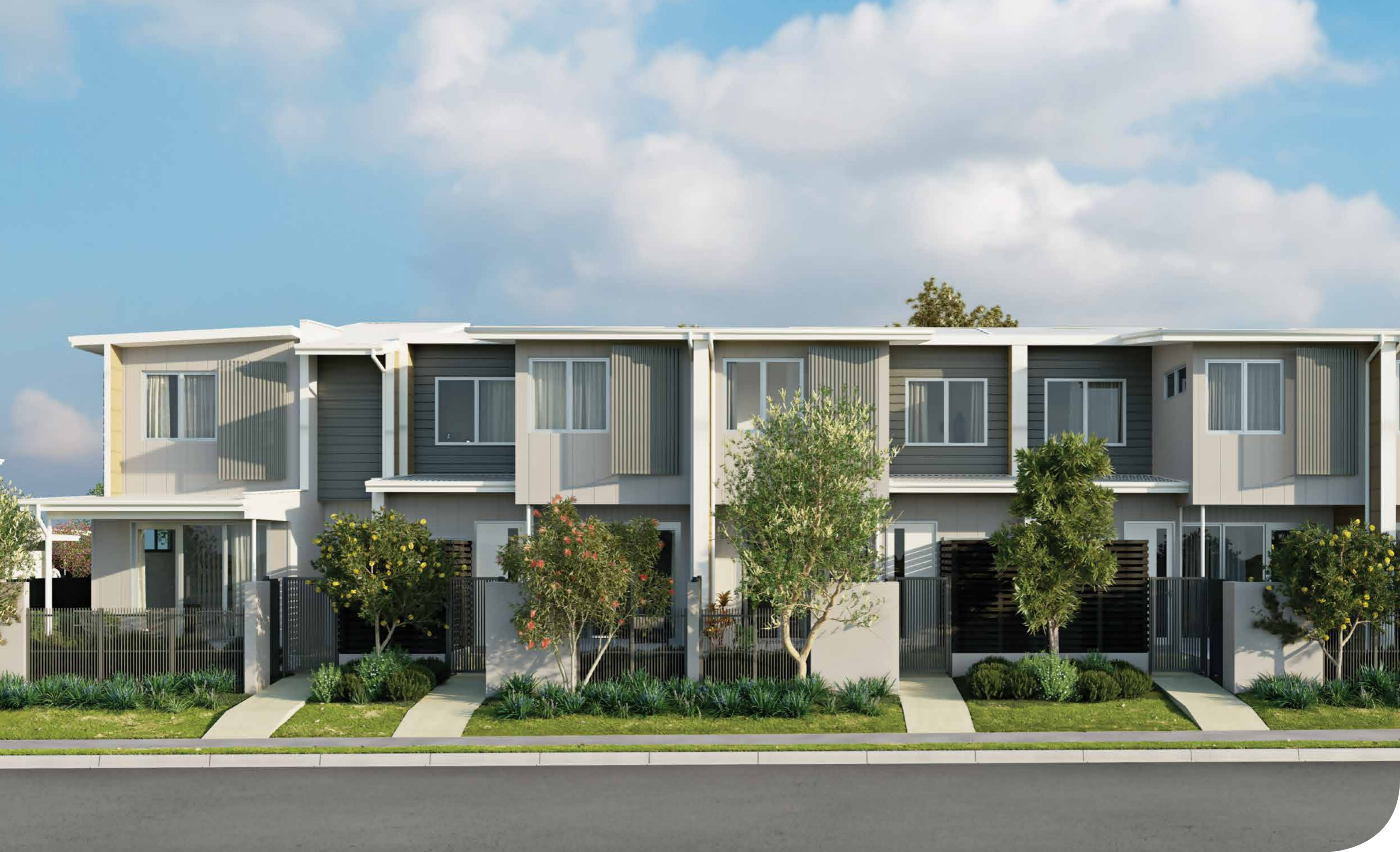
Artist's impression. Subject to change. Furniture not included.