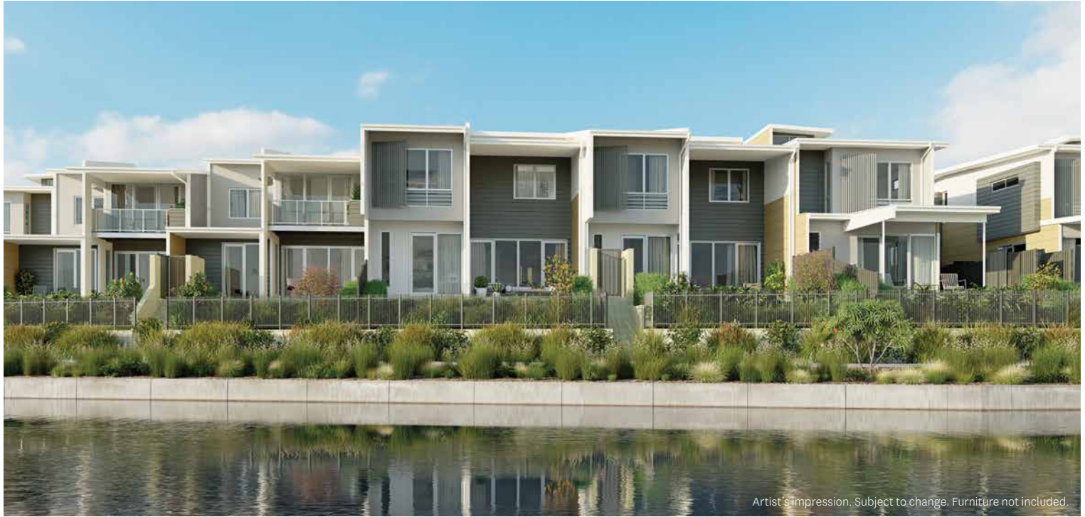
Artist's impression. Subject to change. Furniture not included.