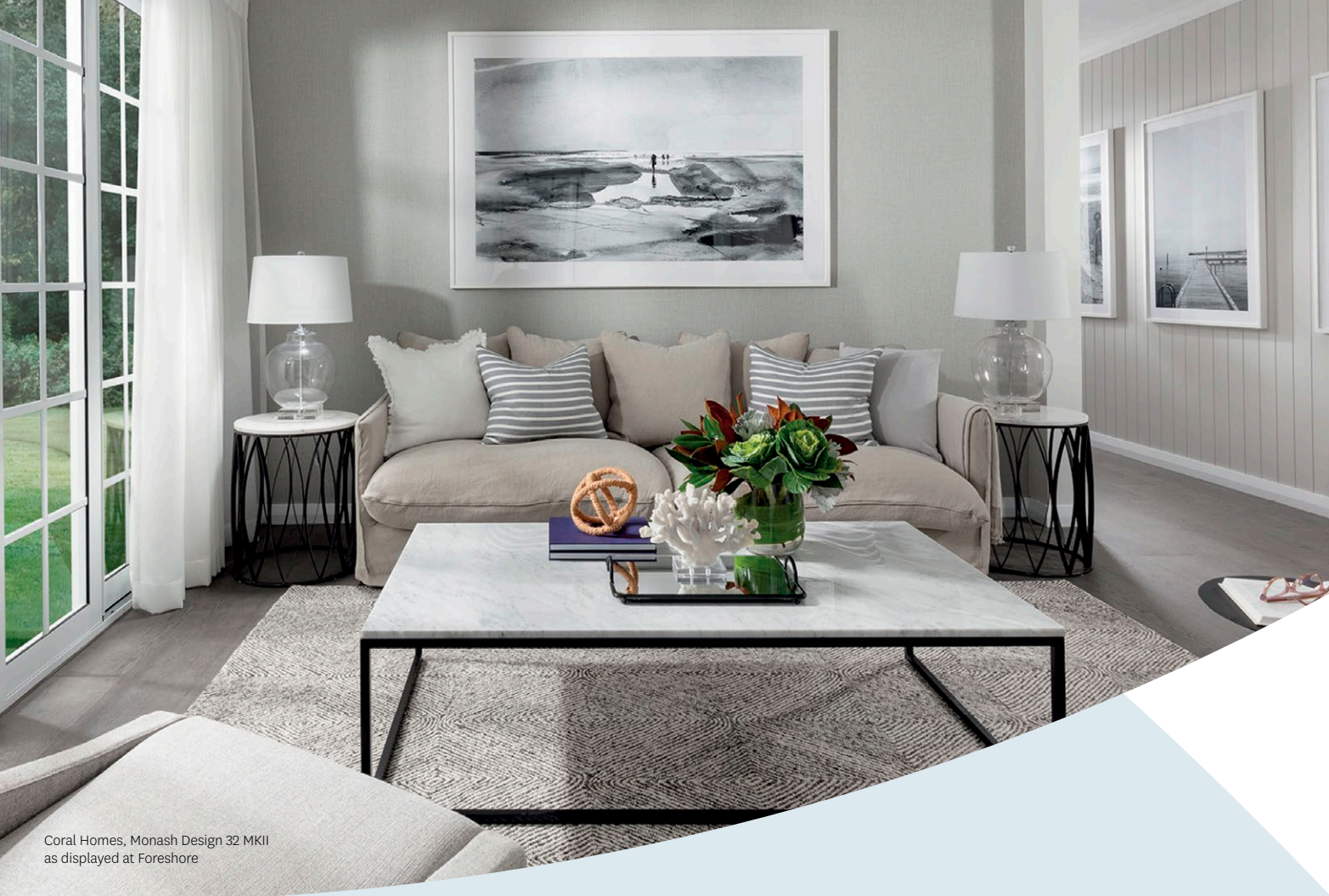
Coral Homes, Monash Design 32 MKII as displayed at Foreshore