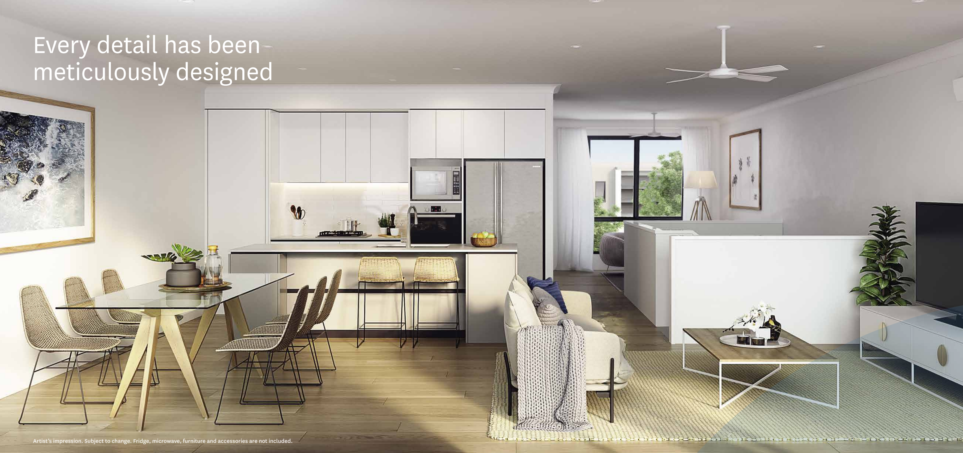
Artist's impression. Subject to change. Fridge, microwave, furniture and accessories are not included.

Every detail has been meticulously designed