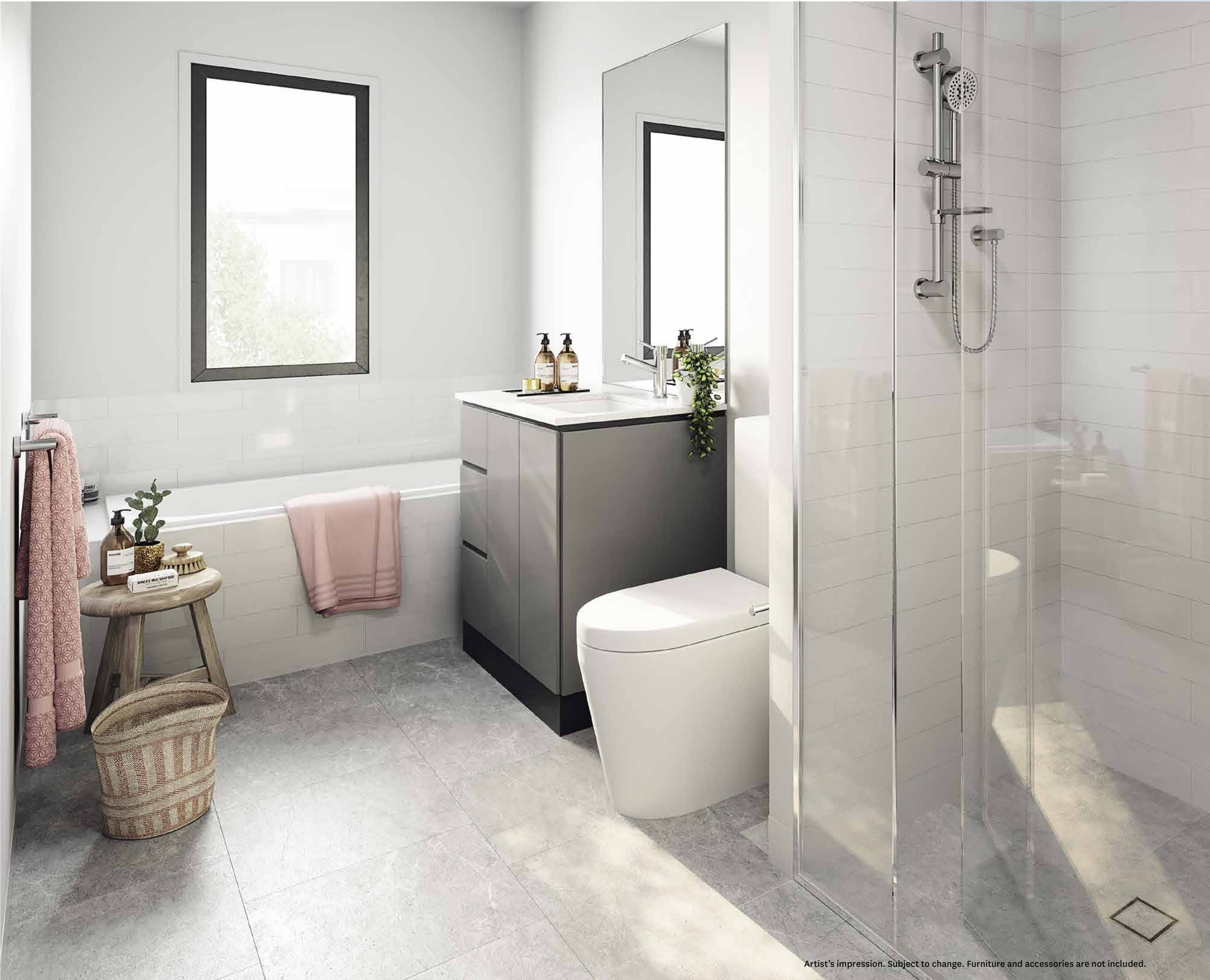
Artist's impression. Subject to change. Furniture and accessories are not included.

Our bright, clean-lined bathrooms are thoughtfully designed for minimal maintenance and maximum sophistication. Imagine soaking away the stresses of the day in a luxurious bath or freshening up in the stylish, wet-room shower, with all your toiletries conveniently stored in the under-sink cabinet. No detail has been overlooked.