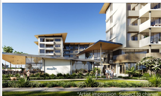
* Artist impression. Subject to change.