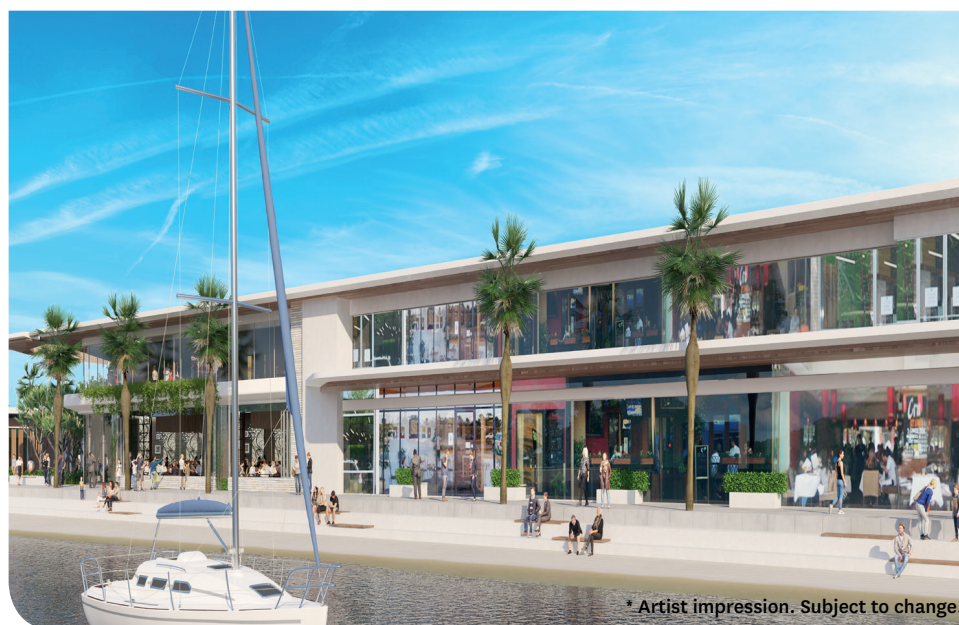
* Artist impression. Subject to change.

We'll be able to share more details with you shortly. For the latest updates, like our Facebook page – facebook.com.au/newportwaterside .