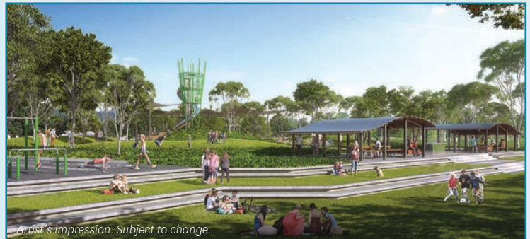
Artist's impression. Subject to change.

Commencement date: February 2019 Anticipated completion date: Mid 2019