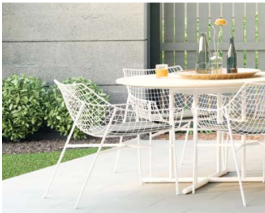
Artist’s impression. Subject to change. Furniture not included.