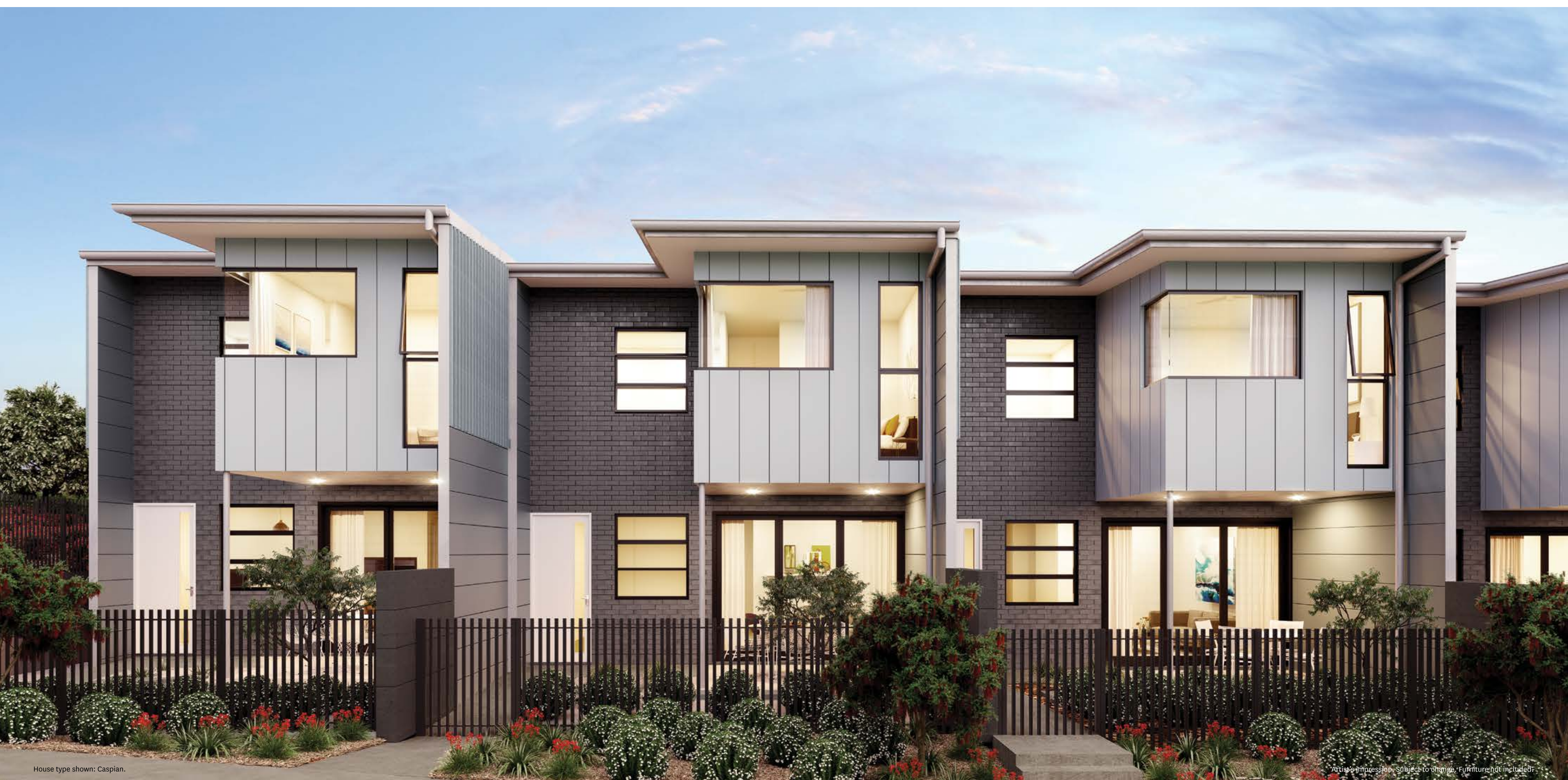
House type shown: Caspian.