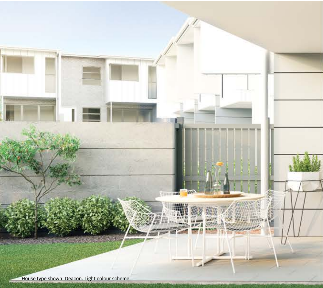
House type shown: Deacon. Light colour scheme.