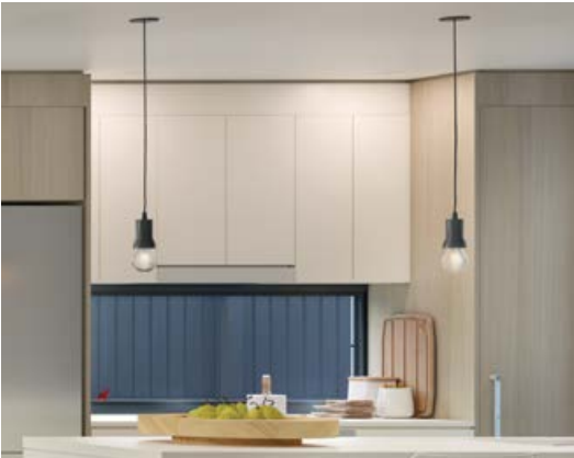
Artist’s impression. Subject to change. Furniture not included. Accessories not included (excluding kitchen pendant lights)

Vida kitchens include feature pendant lighting over the island bench, giving your kitchen that extra bit of glow. A blend of both ambient and task specific lighting will create an inviting atmosphere without overpowering your eyes.