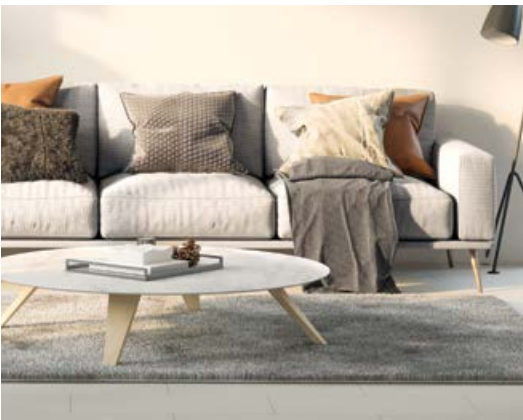
Artist’s impression. Subject to change. Furniture not included.

Your outdoor furniture should reflect the way you like to get together with friends. If you prefer long, lazy lunches, you may want to consider comfortable sofas, so your guests can chat away for hours, or if a summer sit-down dinner is more your style, go for a more traditional setting.