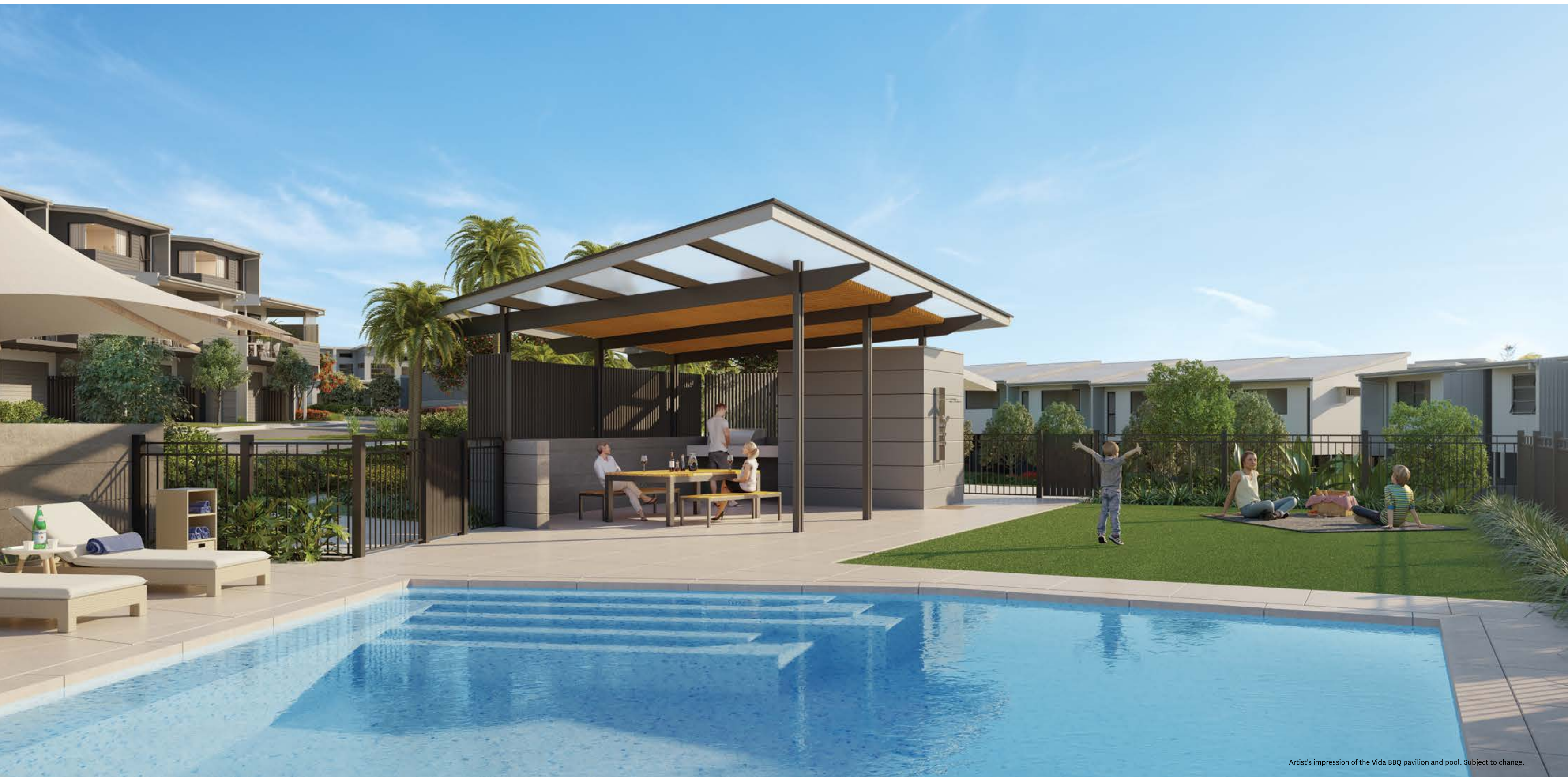
Artist's impression of the Vida BBQ pavilion and pool. Subject to change.

Residents will be able to enjoy all the internal facilities Vida has to offer. Take a walk within the internal walk ways, and gather with friends and family to make the most of the internal park, BBQ pavilion and pool. This is your own, private oasis.