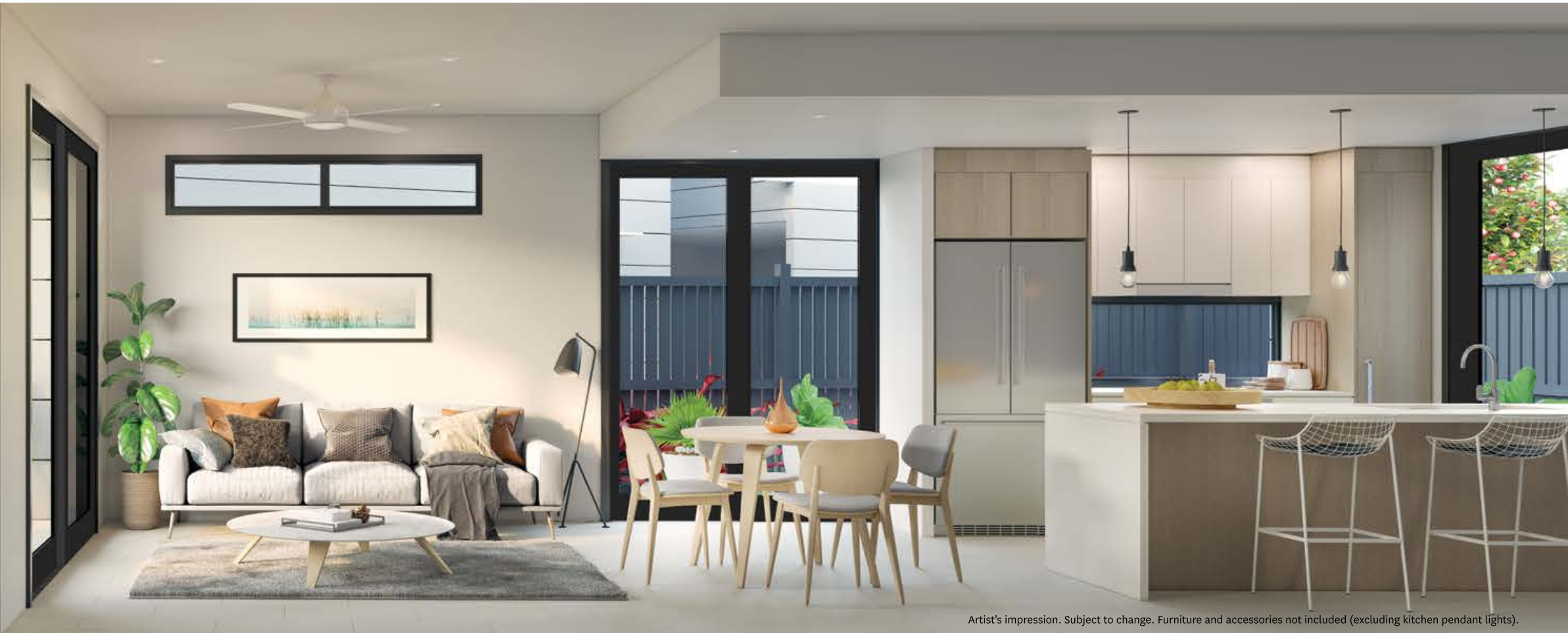
Artist’s impression. Subject to change. Furniture and accessories not included (excluding kitchen pendant lights).