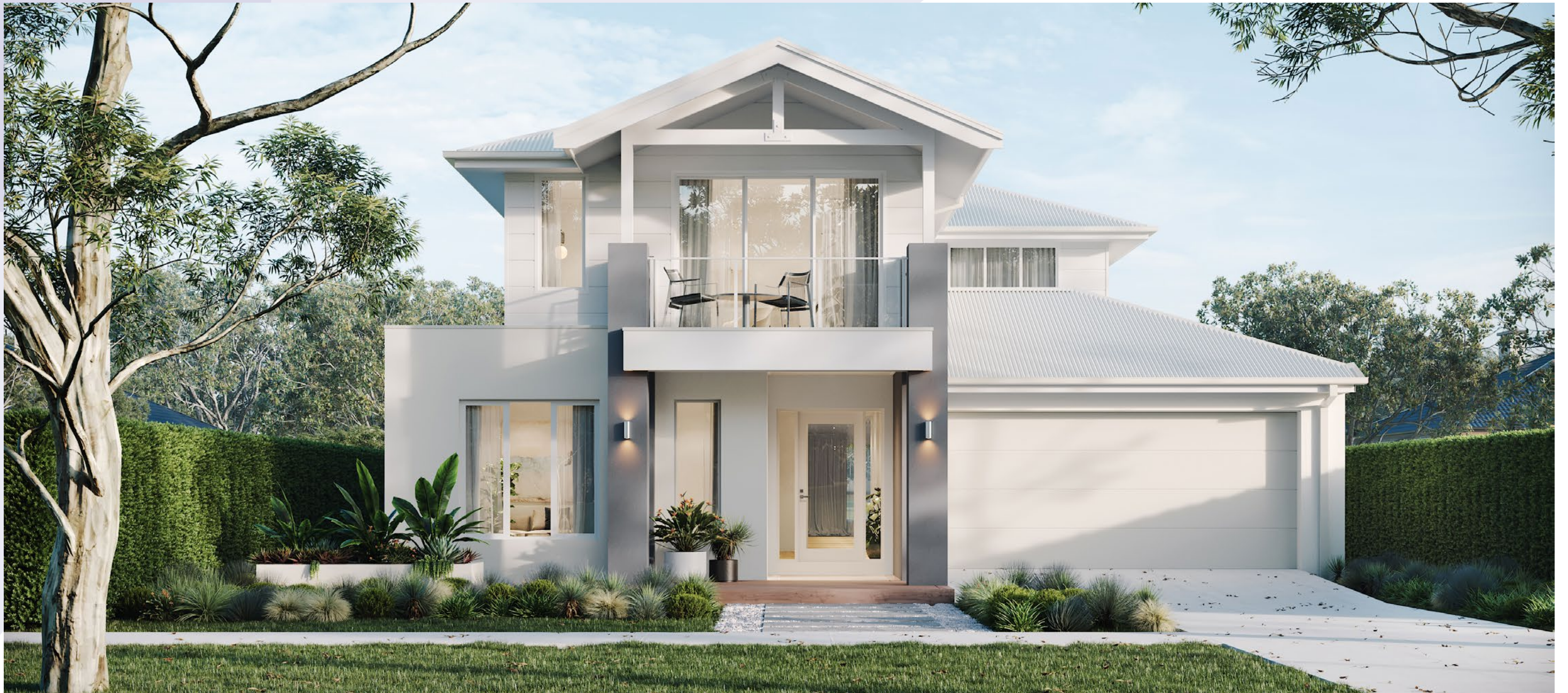
Image courtesy of Boutique Homes. Artist Impression. Subject to change.