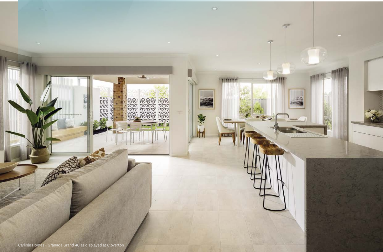
Carlisle Homes - Granada Grand 40 as displayed at Cloverton

Home and land packages are a great way of getting a complete new home solution, so ask your Stockland Sales Professional about a package deal for your chosen home.