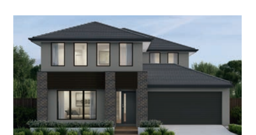
<u></u> □ □ □ □ □ □