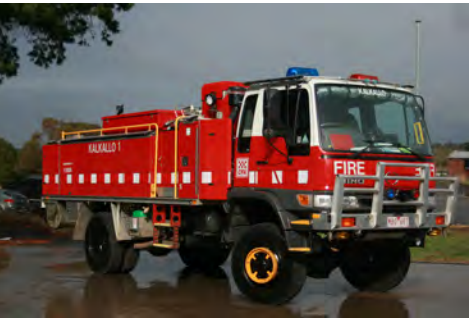
Kalkallo Fire Brigade: visit facebook.com/Kalkallo-Fire-Brigade

You can also download this CFA guide from their website on how to prepare your property. Stay safe!