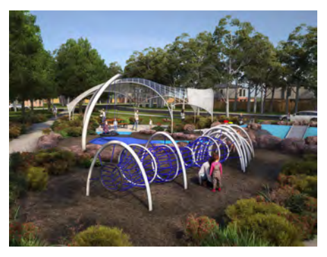
Above image: artist's impression of new park on Dermody Avenue, opening April 2018.

(1) Construction of the park located in Stage 1201, on Dermody Avenue, is due for completion in April 2018. The highlight of the park will be a fish trap net which children can climb through and multi-purpose sporting goals.