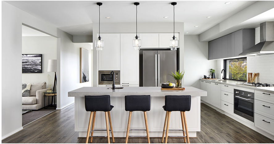
Above image: Oslo 29 by Boutique