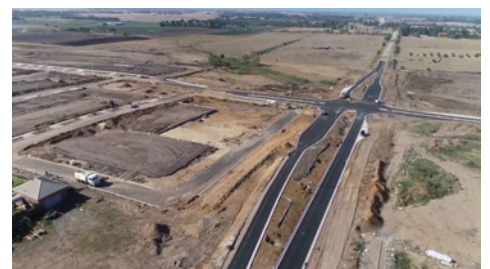
Above image: Construction on Tuckers Road

Civil construction of Clyde Creek is currently underway, with the creek alignment starting to take shape. The landscape embellishment of Clyde Creek is anticipated to commence in Spring later this year, incorporating two shared paths that will run along the length of either side of the creek.