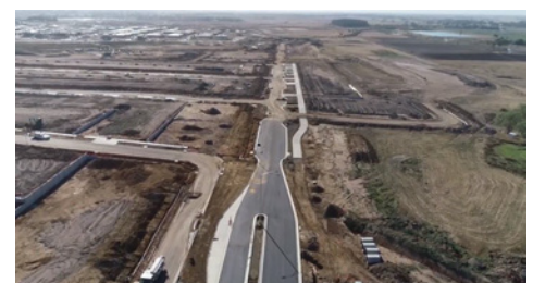
Above image: Construction on Stage 7