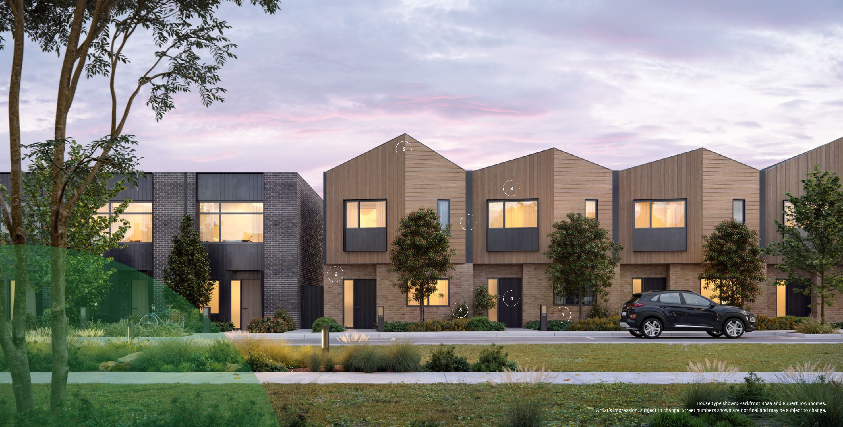
House type shown: Parkfront Rosa and Rupert Townhomes. Artist's impression, subject to change. Street numbers shown are not final and may be subject to change.