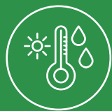
Solar Hot Water*