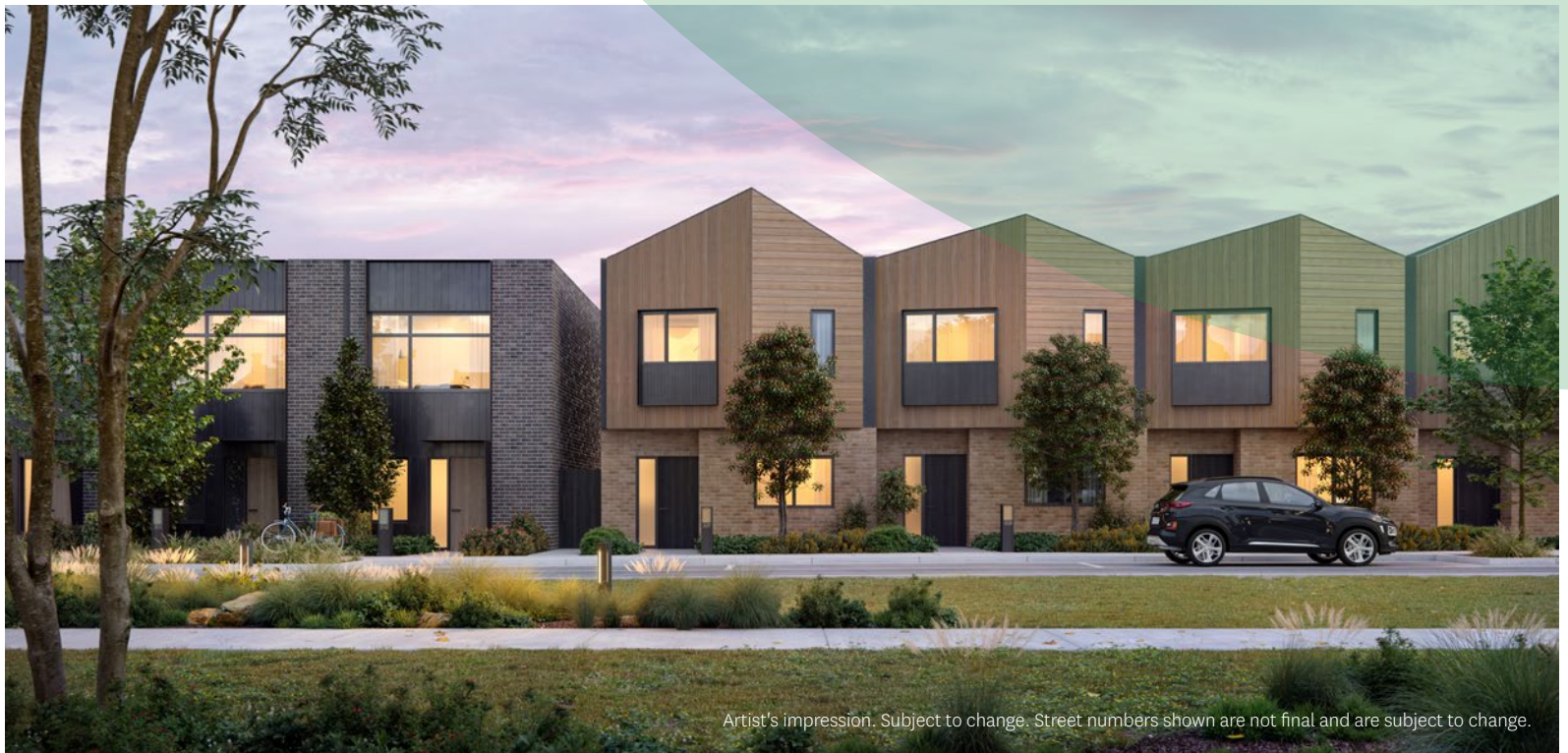
Artist's impression. Subject to change. Street numbers shown are not final and are subject to change.