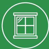
Double Glazed Windows