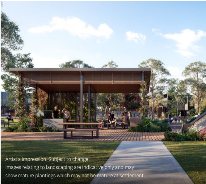
Artist's impression. Subject to change. Images relating to landscaping are indicative only and may show mature plantings which may not be mature at settlement.