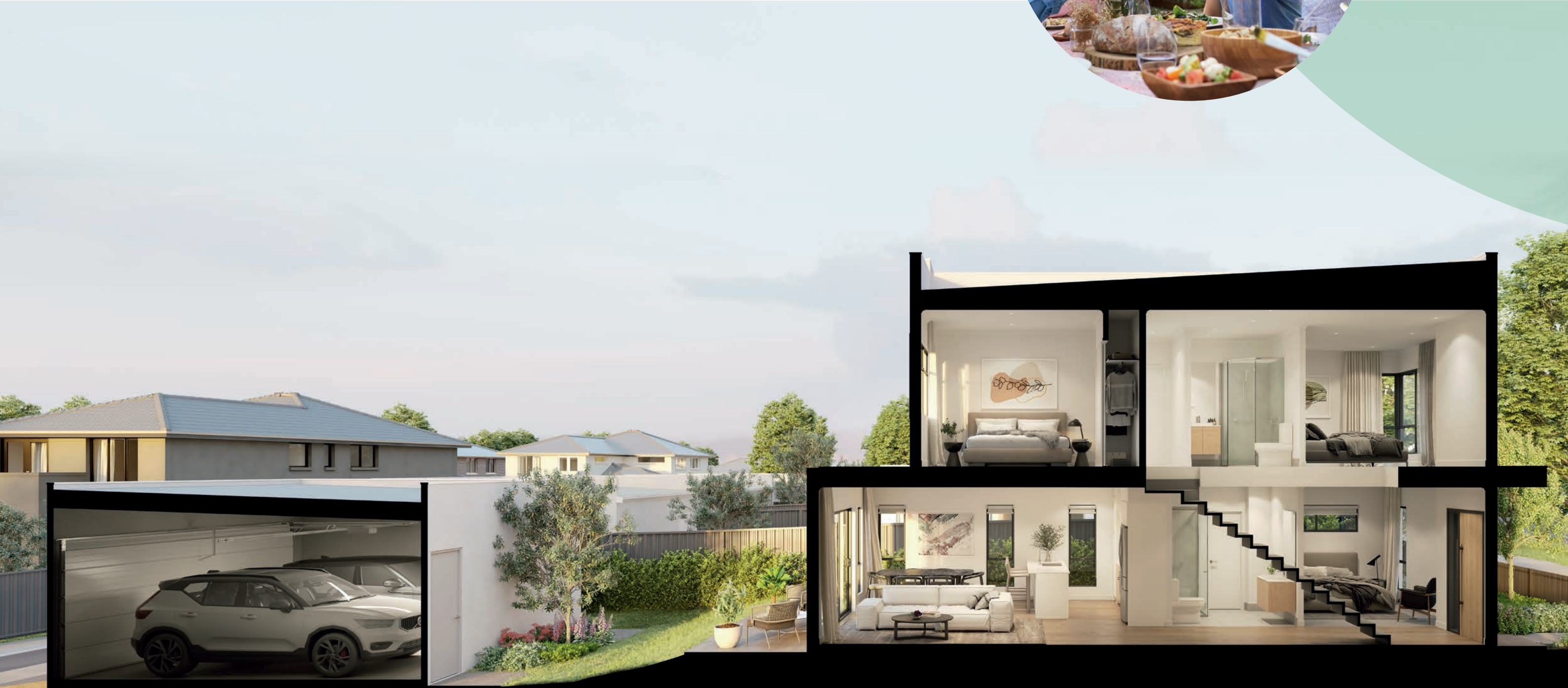
Artists impression subject to change. Landscaping is indicative only and may show mature plantings which may not be mature at settlement. Setbacks may change subject to terms of Building Permit.