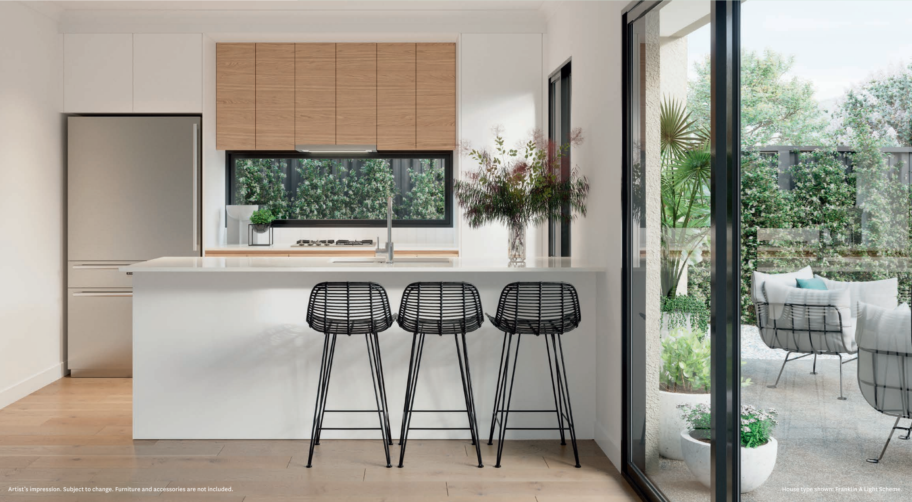
Artist's impression. Subject to change. Furniture and accessories are not included.

The kitchen will be the heart of your new home, with quality stainless steel appliances, beautiful finishes, reconstituted stone benchtops, clever storage solutions and more. Whatever your culinary skills, entertaining will be effortless.