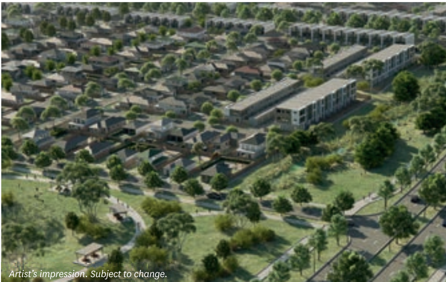
Artist's impression. Subject to change.

Your future home welcomes you at Mode, a vibrant community with fantastic access to Cloverton's future City Centre, main roads, schools, parks and more!