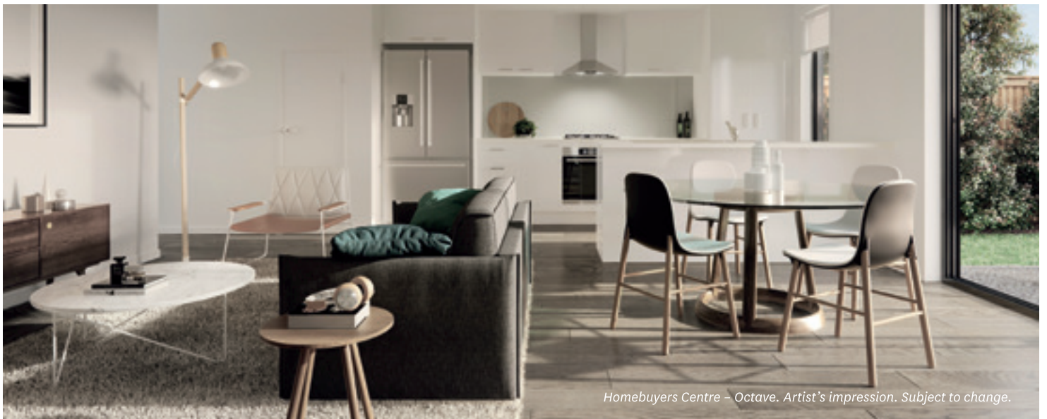
Homebuyers Centre – Octave. Artist's impression. Subject to change.