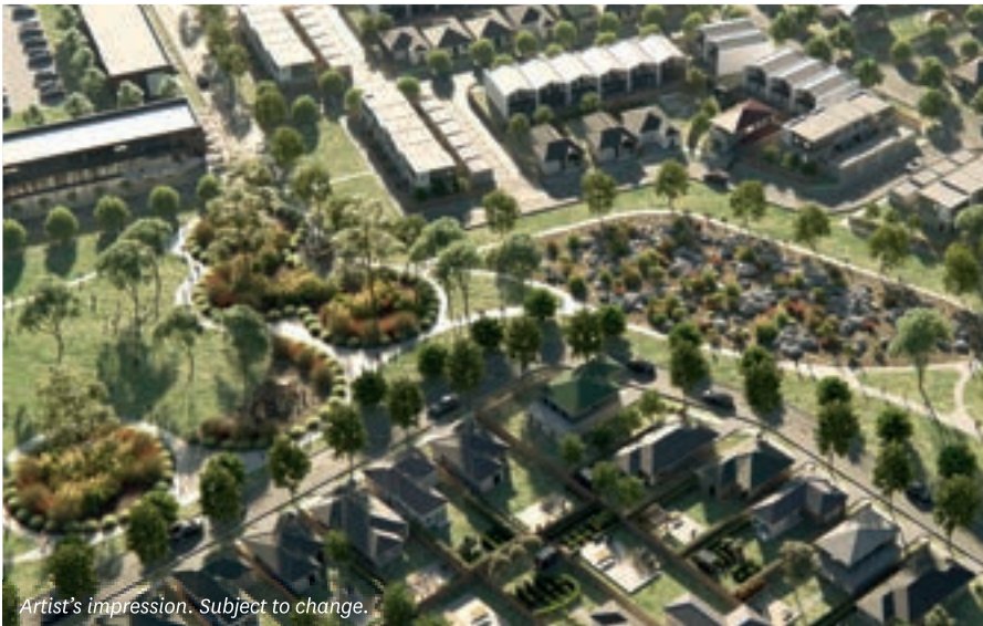
Artist's impression. Subject to change.