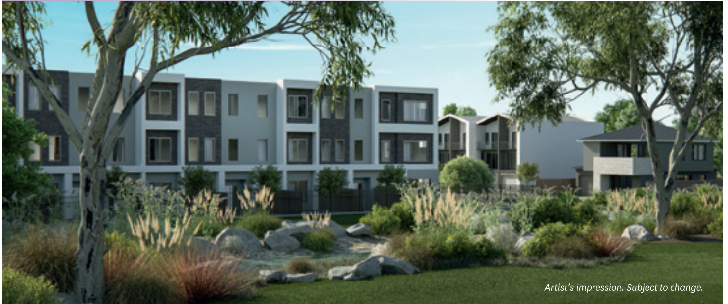
Artist's impression. Subject to change.