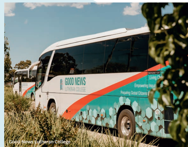
Good News Lutheran College

Plus, with proposed schools, town centres, train stations and the future Tarneit Stadium coming soon, there's more on the horizon for this desired pocket of Melbourne's west.