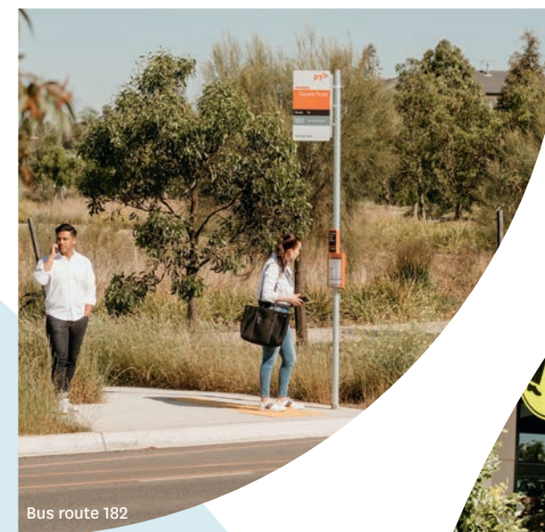
Bus route 182