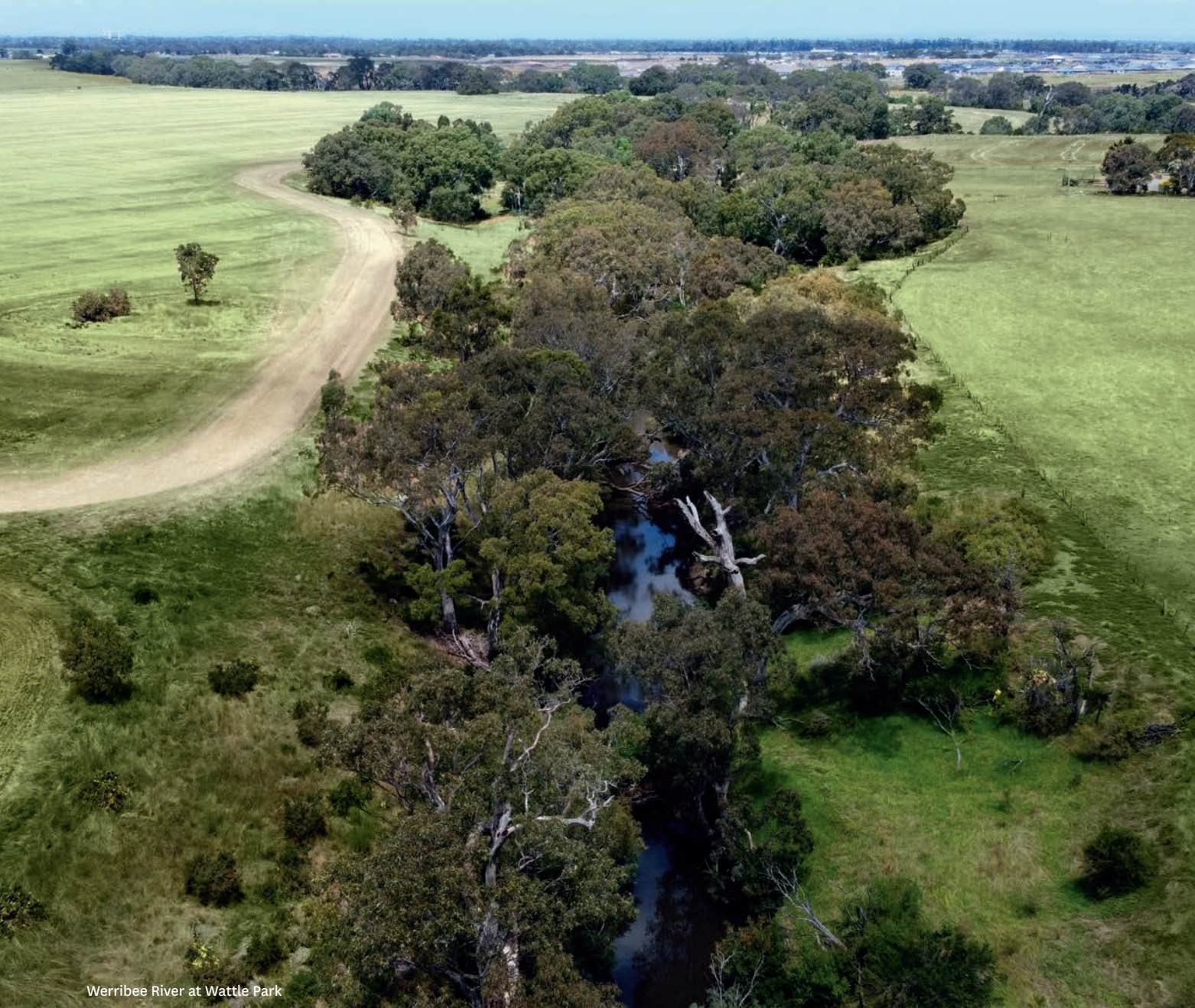
Werribee River at Wattle Park