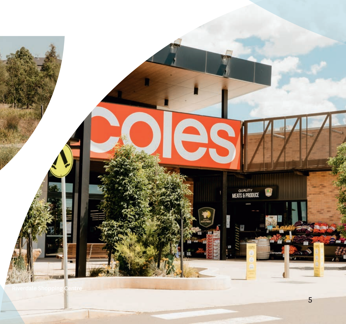
Riverdale Shopping Centre