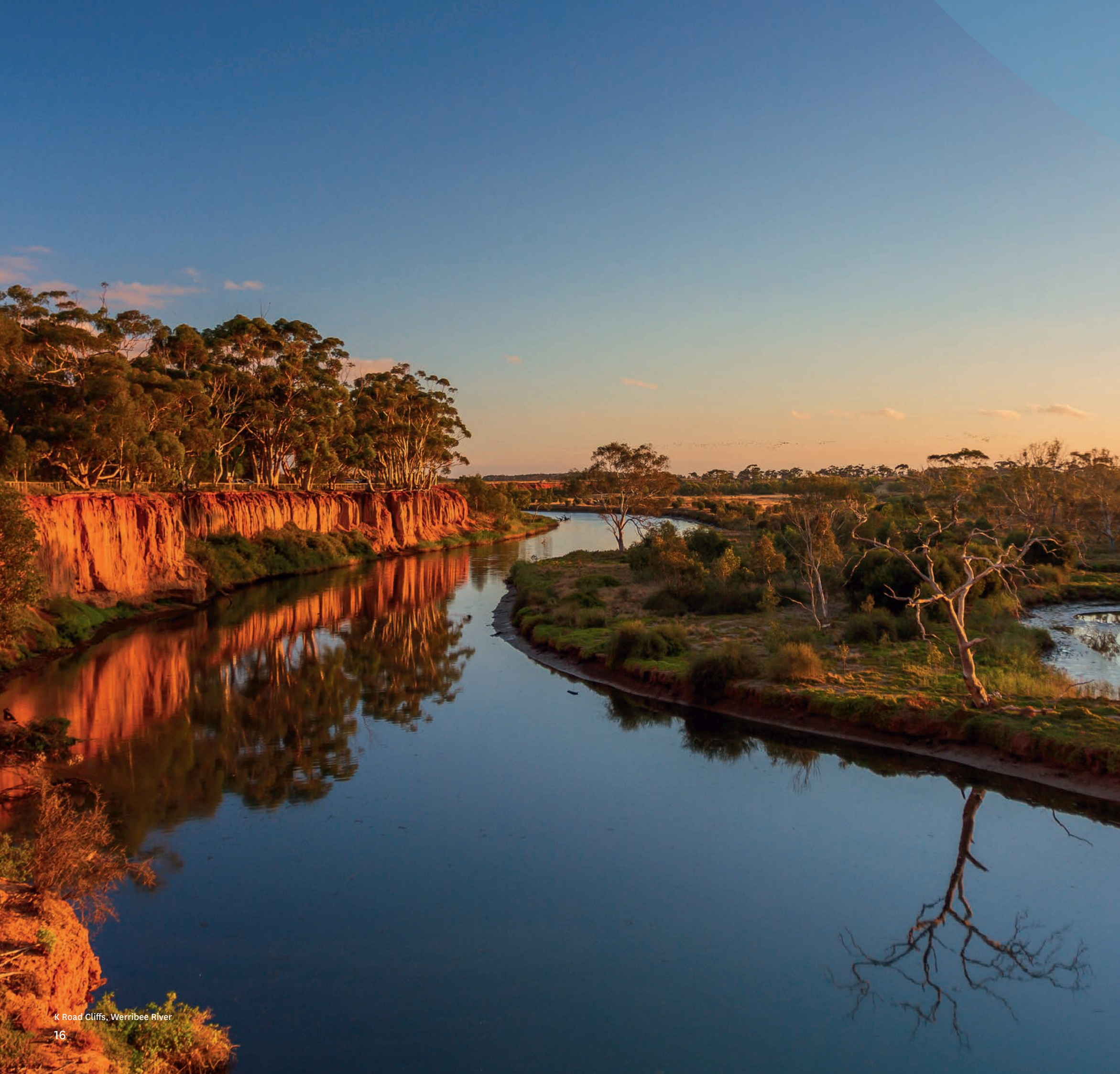
K Road Cliffs, Werribee River