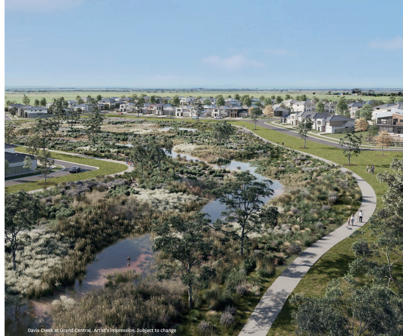
Davis Creek at Grand Central. Artist's impression. Subject to change