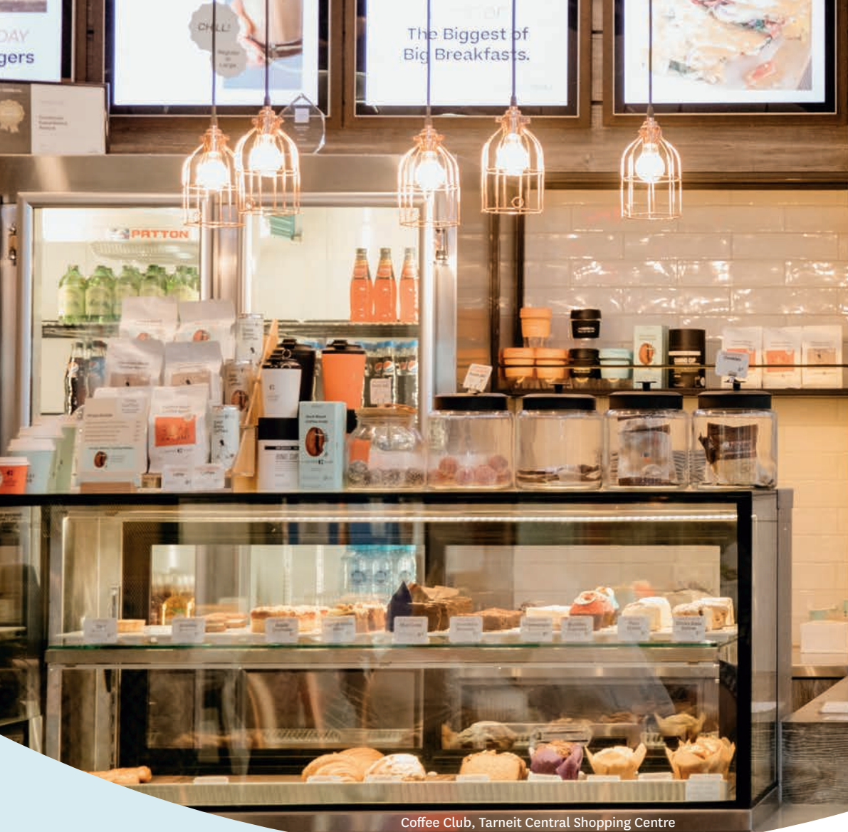
Coffee Club, Tarneit Central Shopping Centre