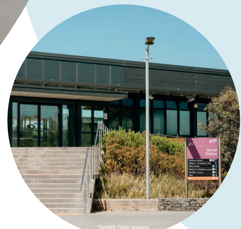
Tarneit Train Station