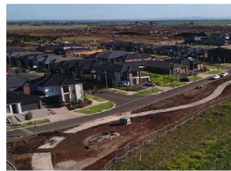
Above image: Davis Creek Landscape Works