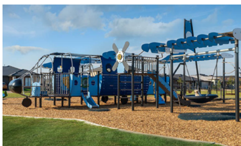
Above images: Aeroplane Park

Located on Stanhope Road (near Yellowfin Drive), Aeroplane Park features a huge cargo plane complete with pilot seats, slides, wings and cabin games. Enjoy aeroplane themed seesaws, a nest swing and a big kick-about space for soccer and ball games.