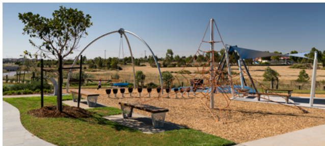
Above image: Growling Grass Frog Park

Located at 180 Davis Road at The Grove Sales Centre and the Little Growling Café, the park is a nod to the Growling Grass Frog species that is native to the area. This park features super-high double slides, a flying fox, nest swing and in-ground trampolines.