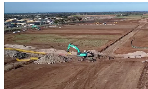
Above image: Construction at Sabha at The Grove

We are excited to announce that works have commenced on the shared trail along Davis Creek. The shared path will be co-located to outdoor fitness stations enabling users to enjoy the best of Davis Creek.