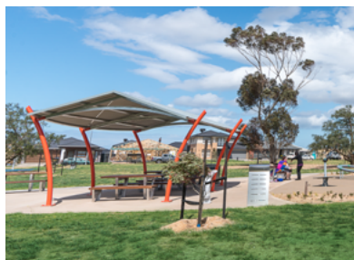
Above images: Banyan Park