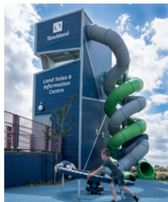
Above image: Children playing at Growling Grass Frog Park