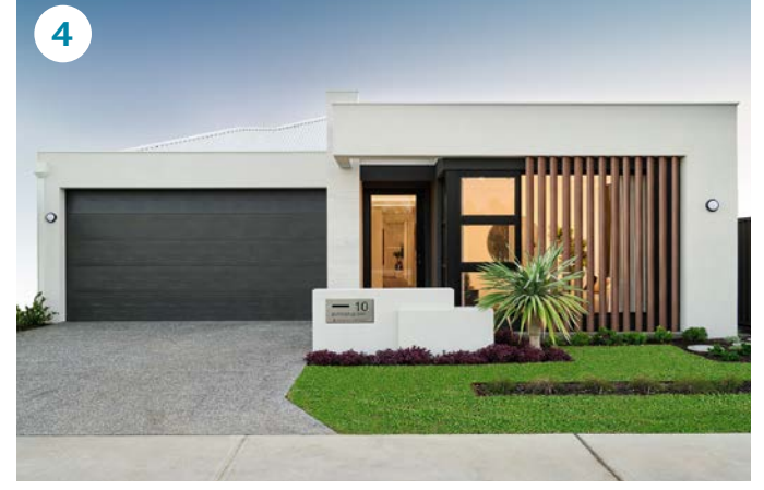
Aveling Homes The Astoria

Lot size: 375m<sup>2</sup> House area: 252.49m<sup>2</sup>