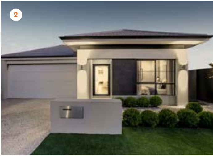
Aveling Homes S3