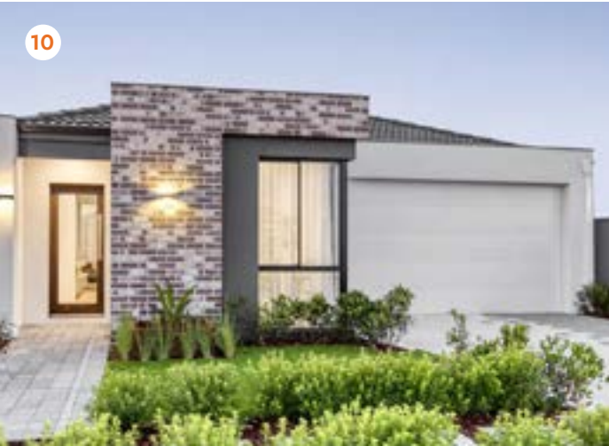
Impressions The Hartley