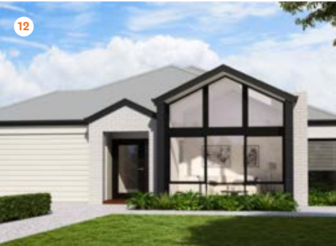
Start Right Homes The Double Peak