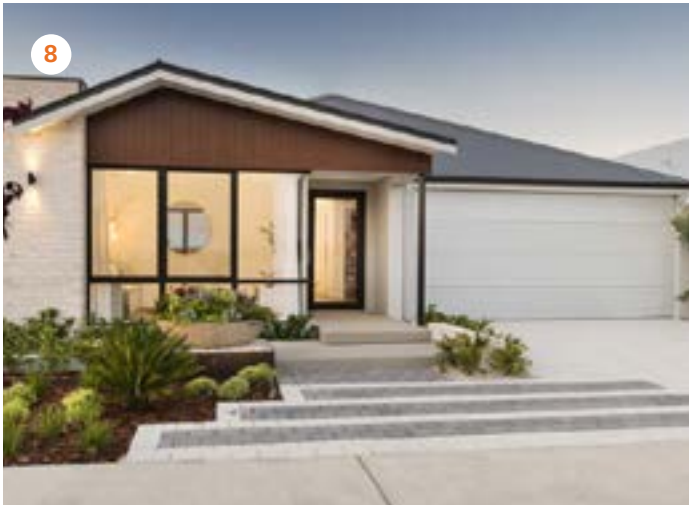
Homebuyers Centre Hamlin