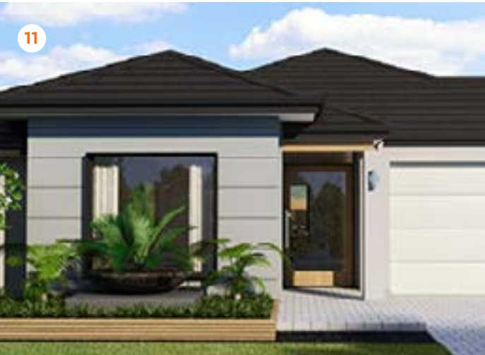
Inspired Homes The Oasis