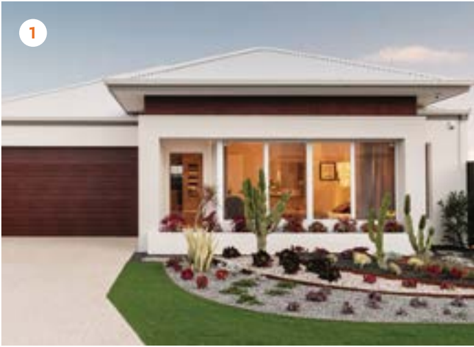
Affordable Living Homes The Sanctuary