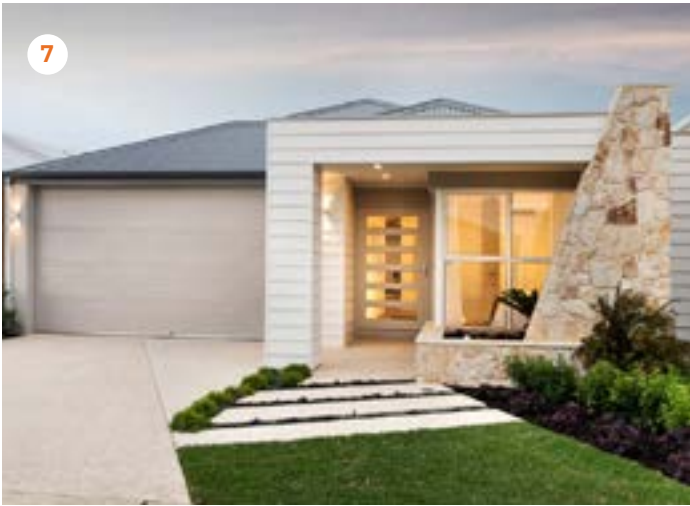
GO Homes The Wayfarer