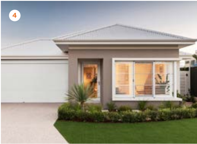
Celebration Homes The Clara