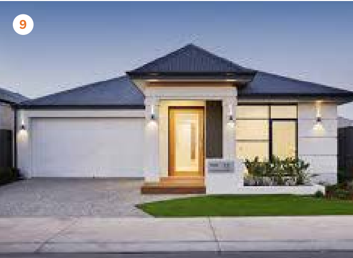
Home Group Charlotte Platinum