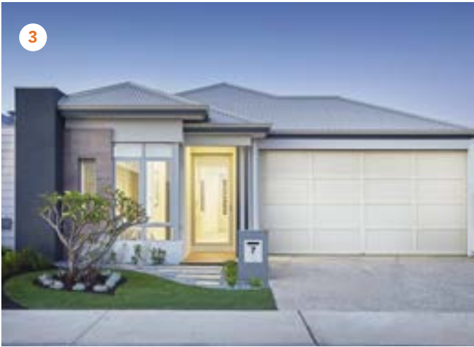
Blueprint Homes The Hunter