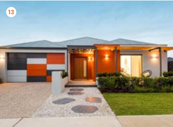
Topend Living Le Chique