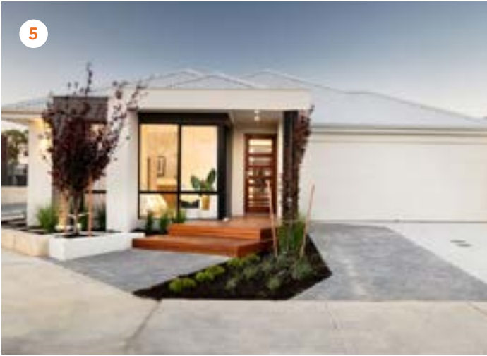
Commodore Homes The Sterlo