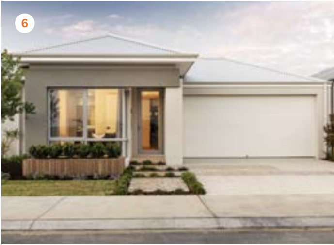
Dale Alcock Homes Soto